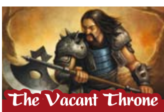
The Vacant Throne