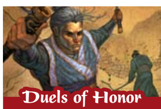
Duels of Honor