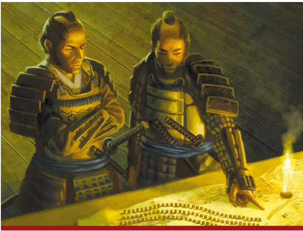
-From Then Till Now , from previous page

they are the gateways to a new world, and the foundations upon which all else rests. Again, it is the intimate co-mingling of game and story that gives rise to the unique vision of L5R: This is a world. You help shape it. The game is the means.