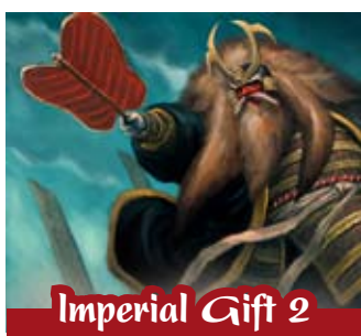
Imperial Gift 2

“Limited: Put one or more cards in your provinces at the bottom of your deck, refilling the provinces face-up.”