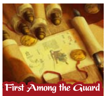
First Among the Guard