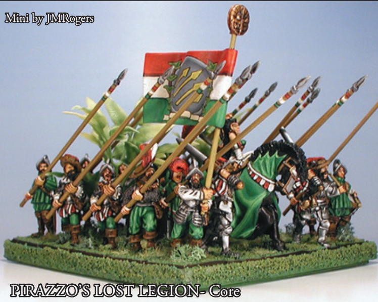
PIRAZZO'S LOST LEGION- Core