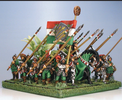
PG. 11- Regimental Review