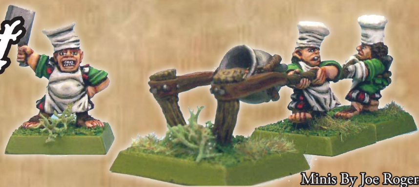
Minis By Joe Rogers

The blood drenched shores of the lake lapped somewhat disconcertingly along the rocky coast against an overcast sky. In the distance crows began to gather in ever increasing numbers, carried along by the scene of death and blood. The wind stirred softly covering the moans of the dead and dying, those that would never see another sunrise and the unlucky few that might survive, although horribly maimed for life.