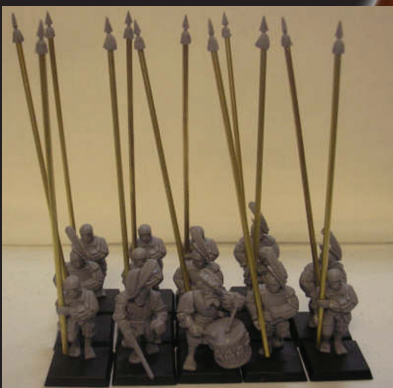
PG. 18- Creating Pikemen