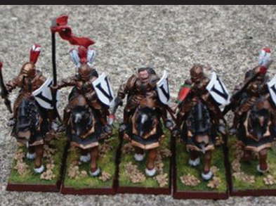
PG. 16- Gallery of Tilea