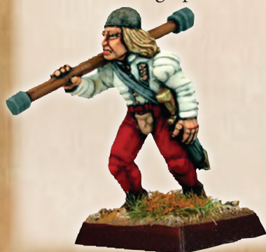
Mini

The key to using a Galloper Gun effectively starts in the deployment phase. It is best to deploy the Bronzino and his team on a flank. To an extent, the placement of Bronzino will depend on what type of troops the opponent has available and knowing how fast an opponent's army can move. One must also be careful not to setup Bronzino and his team in direct line of sight from enemy war artillery. Every turn that the Galloper Gun team is moving, is a turn they are not shooting, thus you will want to get them into firing position as soon as possible. The first turn will see Bronzino and the Galloper Gun team racing up the flank using available terrain to