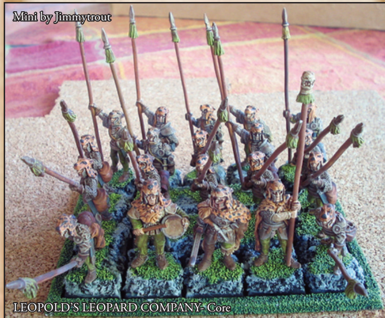
LEOPOLD'S LEOPARD COMPANY- Core

always at a premium when it comes to choosing your forces for a battle and most armies will already have several excellent special units to choose from. As in a purely Dogs of War army, pikemen are a very specialized unit, that must be used carefully to maximize their effect.