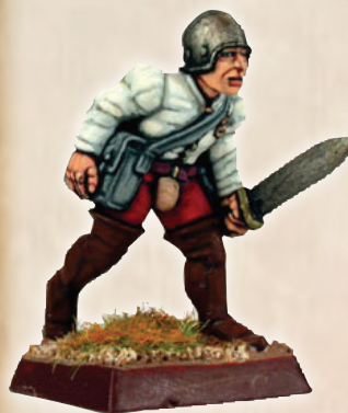
Mini

Targets for the Galloper Gun team should include enemy units such as chariots, all types of cavalry, multi-wound units such as ogres, lone characters, and large monsters. Any opportunity to get a flank shot, especially on a cavalry unit should be taken. Bronzino should be used to hunt down targets of opportunity as well, such as lone characters and small, weak units. He can also be used as an effective march blocker to slow enemy forces down while the other elements of the army get into position or to bait and redirect enemy units to expose the flanks of enemy units to your main combat units. If it is necessary, then Bronzino can sacrifice himself by charging into a tough enemy in order to buy more time. If it becomes necessary (multiple enemy units getting within charge range), then it is advisable to redeploy the Galloper Gun. With their speed, it should be possible to redeploy to a more favorable location to continue shooting in subsequent turns. If an