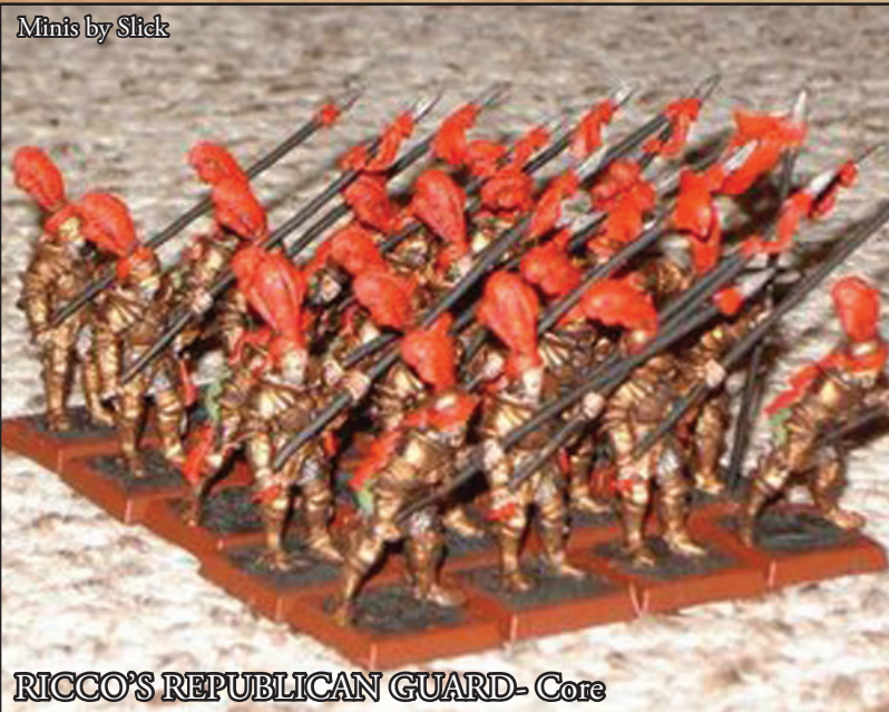
RICCO'S REPUBLICAN GUARD- Core

pike choices. They are neither the most skilled or most heavily armored unit. They are however Immune to Psychology. The unit carries light armor, while Leopold carries heavy armor as well as a hand weapon and pistol. The pistol does allow for some limited shooting, and with his high ballistic skill, Leopold does have a good chance of hitting, especially if deciding to stand and shoot against a charge. As they are Immune to Psychology, the Leopard Company is able absorb shooting and damaging magic spells without fear of panicking as a result of losses. They also provide a mercenary general with a unit that can be counted on to face the myriad fear and terror causing units out there where less stalwart (or religiously fervent) troops might turn tail and flee. Nevertheless, it is only an unwise general who would needlessly waste such valuable and expensive troops.