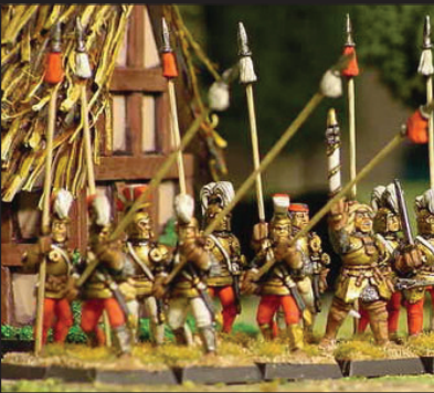
PG. 6- Pikeman Tactical!

"Cry Havoc and let slip the Dogs of War"