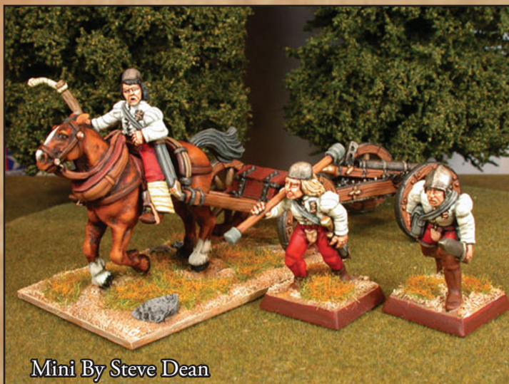
Mini

Bronzino and his gun team have dual purposes. Bronzino is unique among Regiments of Renown units in that he is the only named character who can leave his unit. In this way becomes much more versatile and Bronzino can start earning his points back by acting as a lone mage and war machine hunter. He is also capable enough to charge lightly armed flanking units such as fast cavalry. Sending Bronzino off to engage other enemy units can buy critical time for the rest of the army, especially if fast enemy units are bearing down on the Galloper Gun. A word of caution - while Bronzino is an adequate fighter, it is unwise to expect too much from him or to needlessly send him into a combat he has no hope of winning.