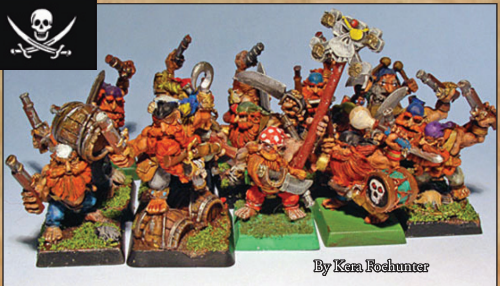
By Kera Fochunter