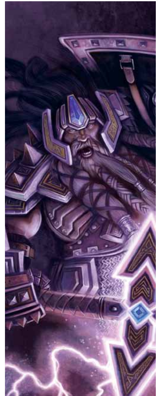
A dwarf warlord

Your trained skills should reflect your interests and background. If, for example, you choose Athletics and Endurance, you might have spent your earlier life in the field, learning to lead by taking the battle to