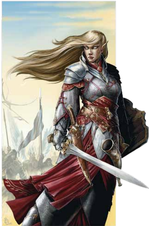
An eladrin marshal stands ready for battle

At this point, you should have all the mechanical details of your character determined. There are a few more decisions to make.