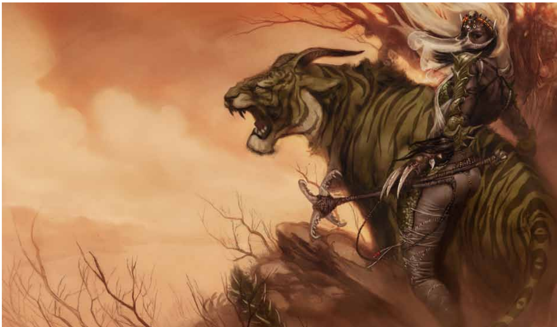
Illustration by Brian Valenzuela