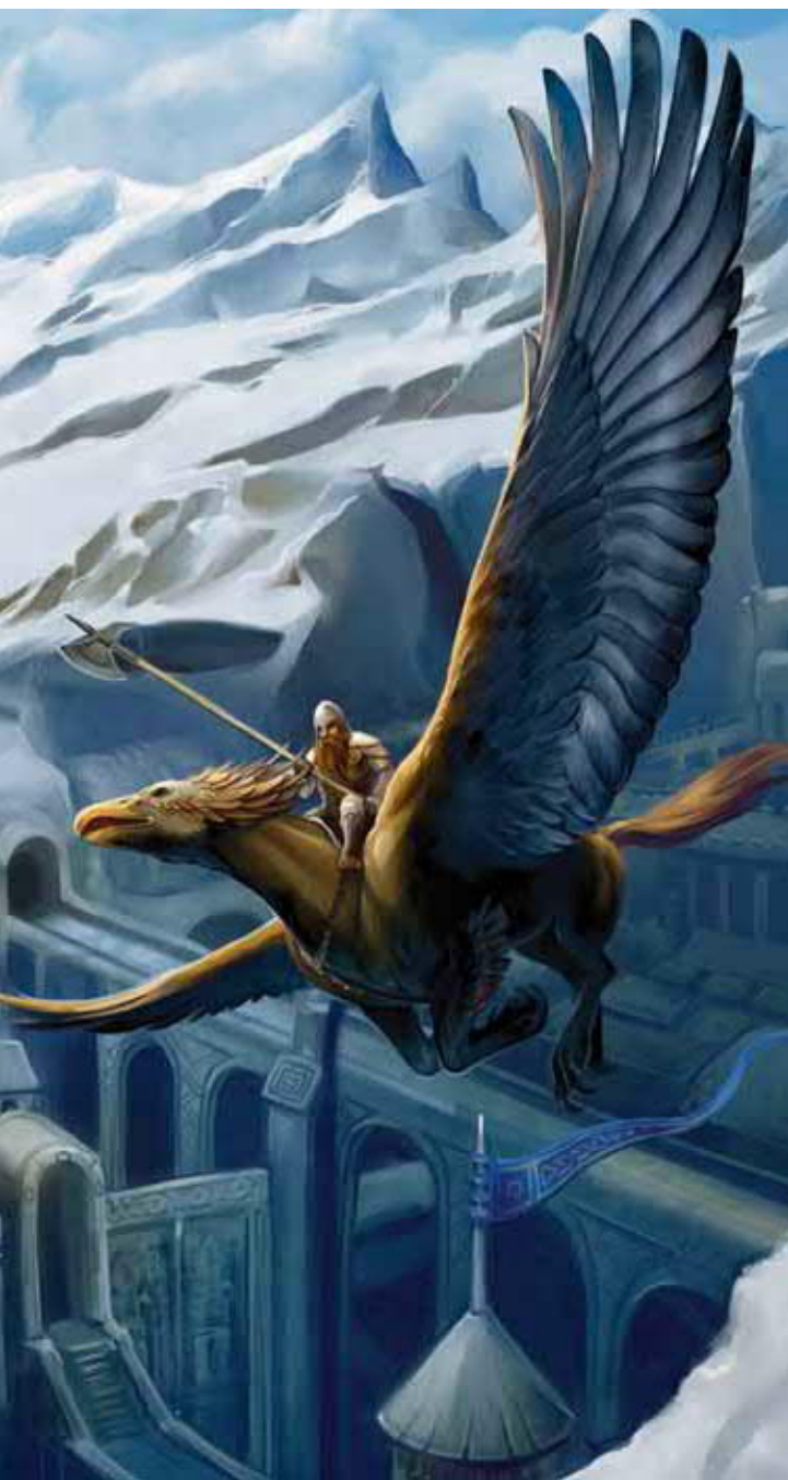
Illustration by Eva Widemann

In many realms and kingdoms, the mounted warrior stands at the apex of military effectiveness. Human knights riding heavily armored warhorses smash orc hordes in overwhelming massed charges; eladrin cavalry sweep through an enemy's flanks, swords flashing in the starlight; goblin wolfriders bound across the battlefield, rending foes with fang and spear; mighty archmages soar over teeming armies on the vast leathery wings of manticores, wyverns, or dragons, raining down destruction from above. No one can deny that the combination of skilled rider and powerful steed is almost irresistible in battle. Any hero can fight effectively from nearly any mount, but a few characters stand out as the masters of mounted combat. The knight is famed for skill in mounted combat, while the cavalier is renowned for his or her steed, charger, or warhorse—a loyal companion and ally touched by the divine favor that follows any paladin in battle.