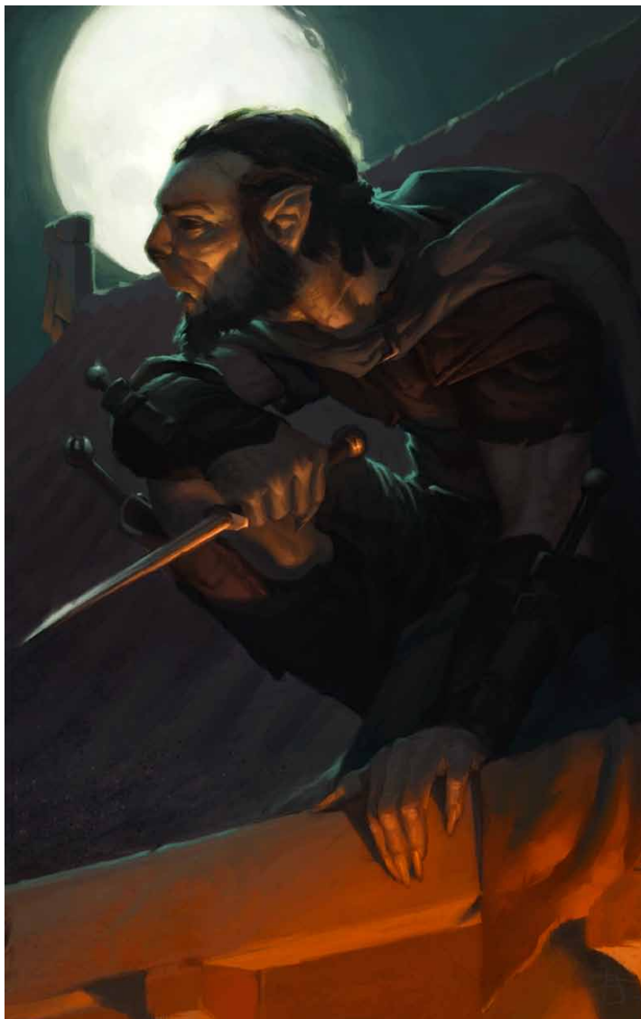
Illustration by Tyler Jacobson

From the moment of birth, shifters can feel the pull within their souls as the moon waxes and wanes. For all the distance between shifters and lycanthropes, shifters still hear the call of the moon within them. As children, shifters learn to control their transformations and to restrain the instincts of the beast. However, shifters can still hear the wolf's howl or the tiger's snarl in their thoughts, and when they close their eyes they dream of stalking their prey and tearing with tooth and claw. Some embrace these feelings fully; the rage of a shifter barbarian is that primal hunger unleashed, and a shifter druid transforms his or her body to reflect his or her inner beast. Others find more subtle ways to channel these natural instincts, but the spirit of the beast is always there. Whatever path a shifter chooses to follow, he or she has the soul of a predator . . . and each shifter can hear the moon calling.