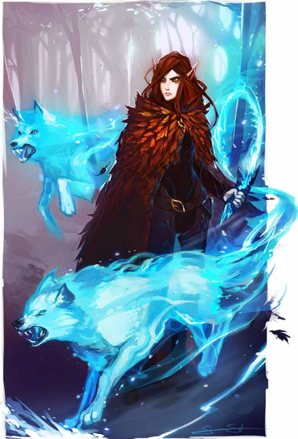
Illustration by Sarah Stone

Chanted words suffused the campsite. The quiet, rhythmic murmur drew casual glances from Corben's companions as they cleaned their swords, patched their wounds, and rifled through their packs looking for hardtack. Corben shut out their movements and whispered conversation, focusing his thoughts on his present predicament. They had scoured the swamps for the bullywug encampment, searching with little luck for the villagers abducted for some dark purpose. Their prowling through the swamps had brought them in touch with other predators and vermin, but the hideous croakers remained elusive.