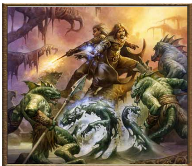
Illustration by Zoltan Boros & Gabor Szikszai

Nearly all adventurers lose a comrade at some point in their careers, but some defenders turn the burden of that loss into new arenas of power.