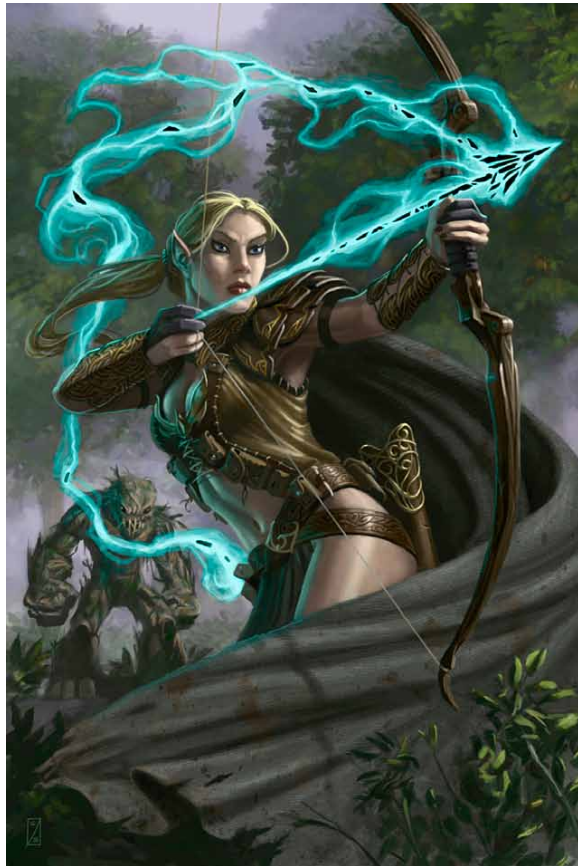
Illustration by Craig J. Spearing

Artificers are as much artists as they are technicians. They see through gifted eyes, perceiving loosed magical energies flowing around them, and with practiced skill they pluck the loosed bits of metamagic to form it into useful objects and enhancements, layering eldritch power onto their allies' weapons, armor, and other gear to augment their natural talents. By using the same techniques, artificers can cobble together useful devices by imbuing arcane magic into the bits and pieces they carry with them, sometimes to create simple devices to destroy their enemies, and at other times to create traps and obstacles for their foes. They could also craft useful and obedient servants.