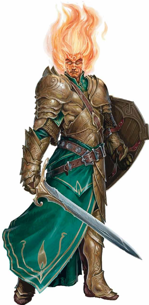
Illustration by Ben Wootten

The world is a scattered mess of wilds and ruins. The fragments of civilization and order that persist today are quiet echoes of the nations that flourished in ages past. From her throne in Celestia, the goddess Erathis commands her devoted to piece together these fragments and forge anew powerful mortal kingdoms.