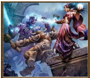
Illustration by Zoltan Boros & Gabor Szikszai

A group known as the Preservers seek to collect and guard knowledge in any form, all in Ioun’s name.