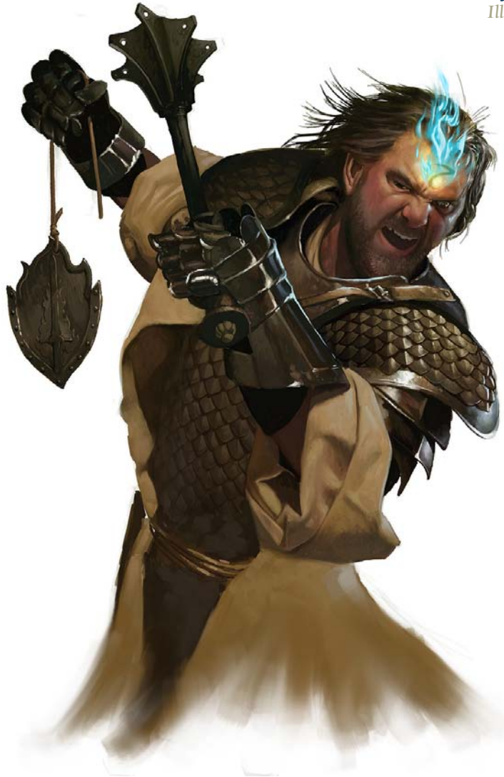
Illustration by John Stanko

With its diverse and chaotic impact, the effects of the Spellplague have been stubbornly difficult to systematize. Two victims of identical exposure can manifest their scars in ways so different as to belie any similarity in their experiences. One might develop hidden mental powers while the other is transformed into a disfigured monster with crippling and uncontrollable abilities.