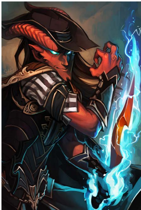
Illustration by Sarah Stone

All chaos sorcerers tap the Elemental Chaos for their power, but while most use that plane's raw energy to unleash wildly devastating spells, others find subtler applications. For these sorcerers, the entropic forces leaking into the world are not manifested as destructive magic, but as the unseen antithesis of natural laws. They use it to defy probability and undermine reality with formless chaos, bending events to their whims with what appears to be exceedingly good luck.