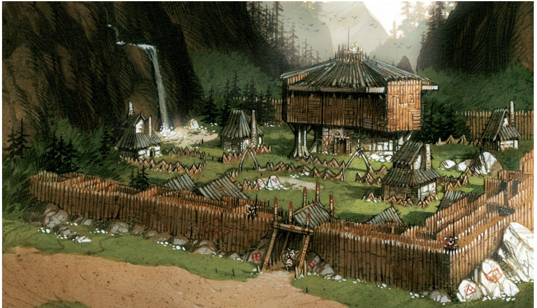
Illustration by Vincent Dutrait