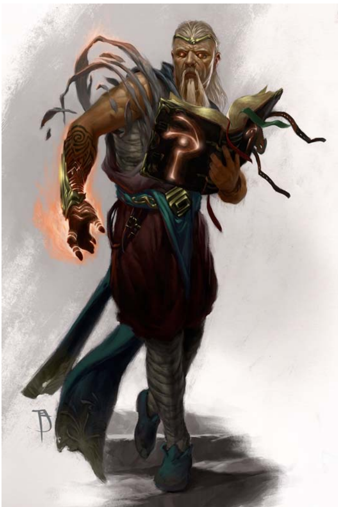
Illustration by Tyler Jacobson

Overlooking the crystal clear ocean of the Feywild stands a towering lighthouse, its beacon illuminating the path to safe harbor. Straddling a bleak desert crossroads in the Shadowfell, a caravanserai sends light onto the night sands, welcoming any who cross her threshold in peace. Far beneath the earth, hidden among the labyrinthine halls of a dragon ossuary, an obsidian archway opens onto a lively tavern. These and other remote structures are redoubts of the collectors, an ancient order of Ioun dedicated to preserving knowledge in preparation of coming darkness.