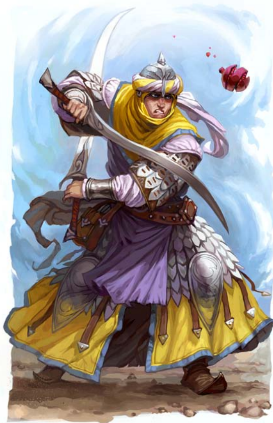
Illustration by Alexey Aparin

The thunder of charging hooves, the flash of whirling scimitar blades, and entreaties to emulate the deeds of revered ancestors are the sounds and images that spring to mind when one talks of the elves of Valenar. The martial traditions of the Valenar elves are founded on three pillars: mastery of curved blades, fighting from the back of specially bred horses, and upholding the honor of past heroes.