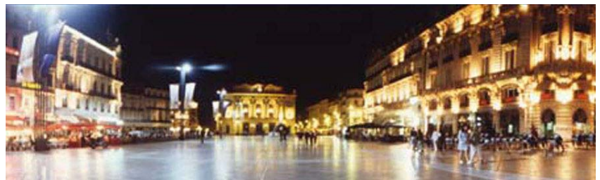
Montpellier by night

Montpellier (A) theoretically belongs to the Fief d'Aquitaine & d'Occitanie but the Marquis de Morsac knows better than to delve into the city's affairs. This rare situation (his Seneschal being of a different Clan) could be explained by the presence of Esteban Rashaun, Lasombra Herald to the Justicariate in the city.