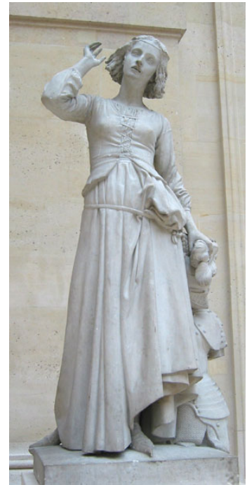
Joan of Arc listening to her voices (Villon's collection in the Louvre).

1493: Creation of the Camarilla. Completely absorbed in Ventrue vs. Toreador intrigues, no French Kindred really gives a damn. Parisian Toreador Rafael de Corazon (a close ally of Béatrix and her protégé François Villon) is one of the founders of the Camarilla. Madame Guil, another Frenchie, is the first Toreador Justicar.