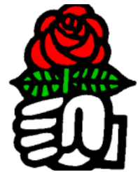
"The fist and the rose", emblem of the French socialist party

1981: For the first time since the 1930s, a socialist is elected president. François Mitterrand makes extensive use of his party's symbol (the rose) and heavily subsidizes education, culture and the arts. Most non-Toreador shake their heads in disapprobation, muttering things about the Masquerade and the death of subtlety in these modern times.