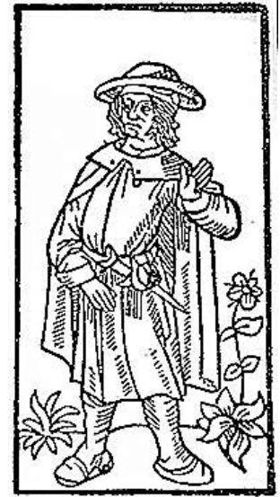
François Villon (back when he was alive)

A Marquis gets to choose his Sénéchal -also called Régent- and his Prévôt (Sheriff) but must submit his choices to the Légat. Most Sénéchals are the Marquis' Childe and are almost always of the same clan, while Prévôts can be of any Clan. The Marquis can also nominate the Gardien de l'Élysium (Keeper of Elysium) but Villon vetoes any non-Toreador nominees. Domains have reinstated the office of the Fléau (Scourge), chosen by the Prince, while the Harpie is chosen by the Primogen Council.