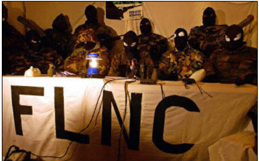
A Corsican activist press conference

Corsica (12) , a Mediterranean island to the south east of France, is closer to Sardinia and Italy. It is even more fiercely secessionist than the Basque country and many Corsicans see themselves as colonized by French invaders from the continent. It is one of the few places in France when you can assassinate a state official or blow-up police stations without triggering too much reaction from the locals. As a result, Corsica is mainly used as a battlefield for various Brujah factions, some of whom are linked to the Sicilian Mafia. Most masquerade their battles as infighting between various secessionist movements.