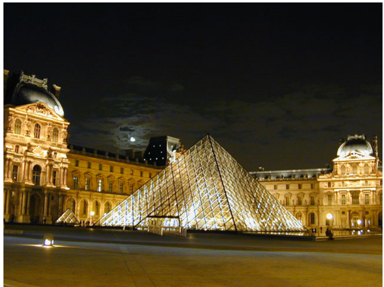
Paris Elysium : The Louvre courtyard

worse. Indeed, America can prove dangerous for adventurous French Kindred: former Sénéchal of Marseille Jean-Louis de Beaumont traveled to America out of curiosity, only to discover that his new Prince was Sabbat and was swiftly decapitated by said Prince. The few that make it back are usually regarded with a mix of scorn (they're upstarts) and envy (especially for non-Toreadors, since they've experienced a much different Clan power balance). Finally, some Parisians leave on their own volition and for good: first an assistant Prévôt of Paris, then Prévôt of the Fief du Nord, Godwynn Lancaster is more known in the United States for his victories against the Sabbat in Arizona.