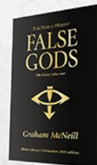
FALSE GODS PAPERBACK