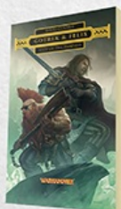
CITY OF THE DAMNED PAPERBACK