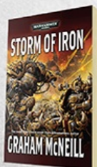
STORM OF IRON PAPERBACK

Inspired by scenes from The Buried Dagger , this set brings the imagery from the 31st millennium to life in your home or workplace.