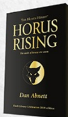
HORUS RISING PAPERBACK

Chosen by you! Two fan-favourites from the Black Library archives, available for a limited time.