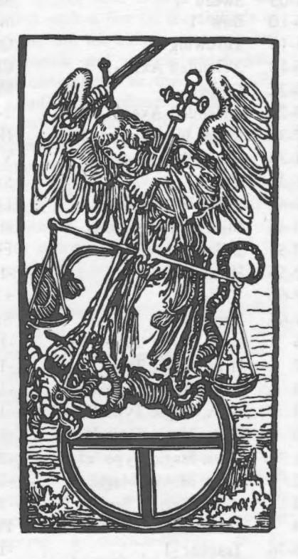
Thieves must beware Justice's sword!

Spot Thievish Activity: This ability gives a thief a basic 50% chance of spotting ongoing thievish activity by a thief of his own level, or the results of such activity. This percentage is adjusted 5% for each relative level difference of the active thief and the spotting thief. Thus, if a 15th level thief is using this ability, he would spot the activities of a 12th level thief 65% of the time.