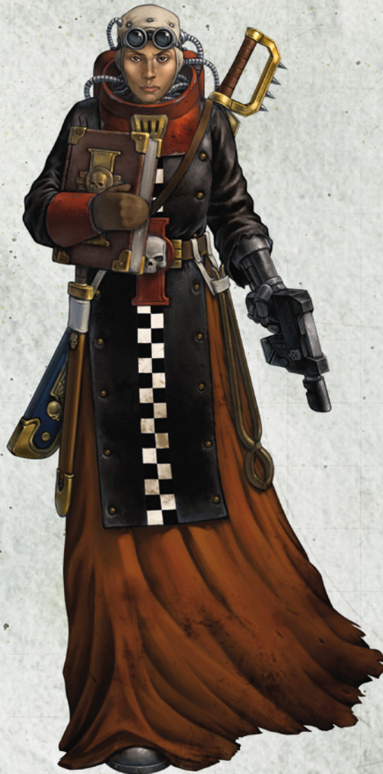
LADY YYRMALLA ALERETTA INQUISITORIAL ACOLYTE