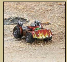
Right: Ork Trukk, this simple conversion involved filling the hole where the gun normally sits.