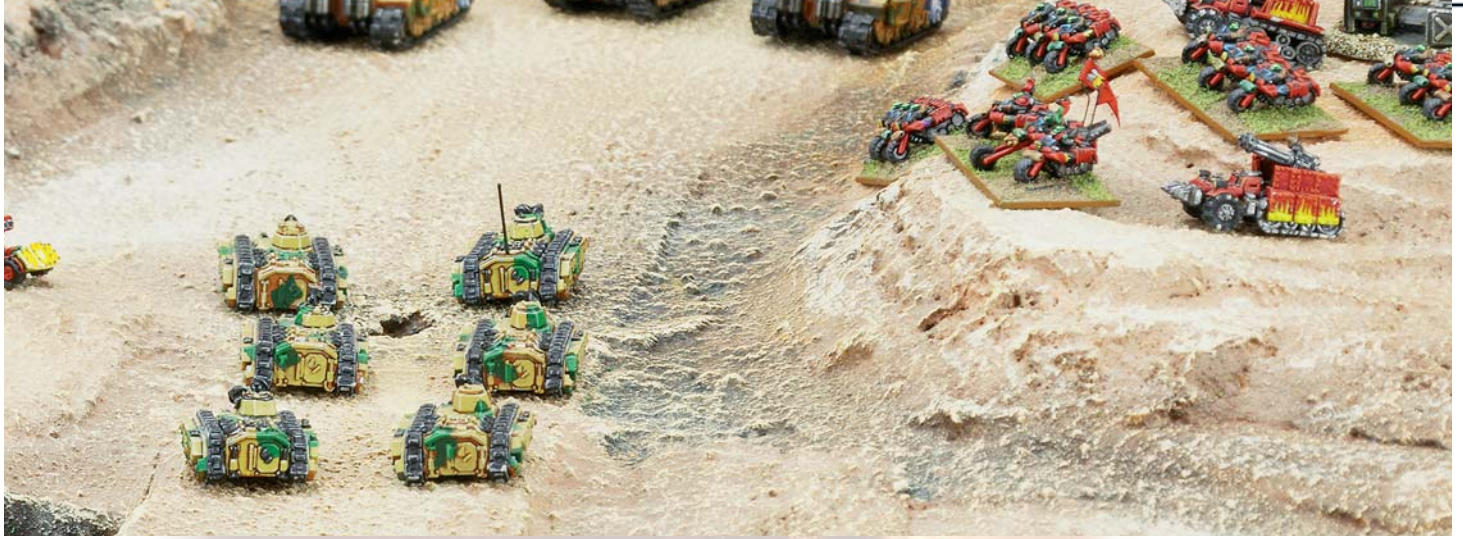
Ork Speed Freeks ambush a convoy of Steel Legion Chimeras that has lagged behind the rest of the Imperial armoured column.

vehicles – known by the Orks as 'da Kult of Speed' – accounts for the vast array of customised buggies, bikes and ramshackle vehicles that can be mustered by an Ork Speed Freek warband. Most are in a constant state of disrepair, with bits falling off every few miles or so. A lot of these vehicles are owned by Mekks, who have been known to attempt repairs while the vehicle is in motion! Orks suffering from extreme speed addiction find it difficult to stop once they've revved up to full speed.