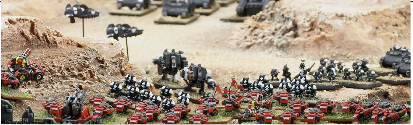
The Black Templars try to hold back the advance of the Speed Freaks, until much needed reinforcements arrive.

Finally, some players have asked if this approach means that they can't use models unless they are painted in exactly the right colour scheme for the army list being used. This categorically is not the case. Although the army lists are specific, they can be used quite happily as stand-in lists for models painted to represent other armies. For example, if you have a Blood Angels Space Marine chapter, then you can use the models with the Codex Astartes army list, or at least you can until we publish an army list specifically for the Blood Angels. By the same token, if you have a Cadian Imperial Guard army, you can use your models with the Steel Legion army list until we publish an army list specifically for Cadian regiments, and so on.