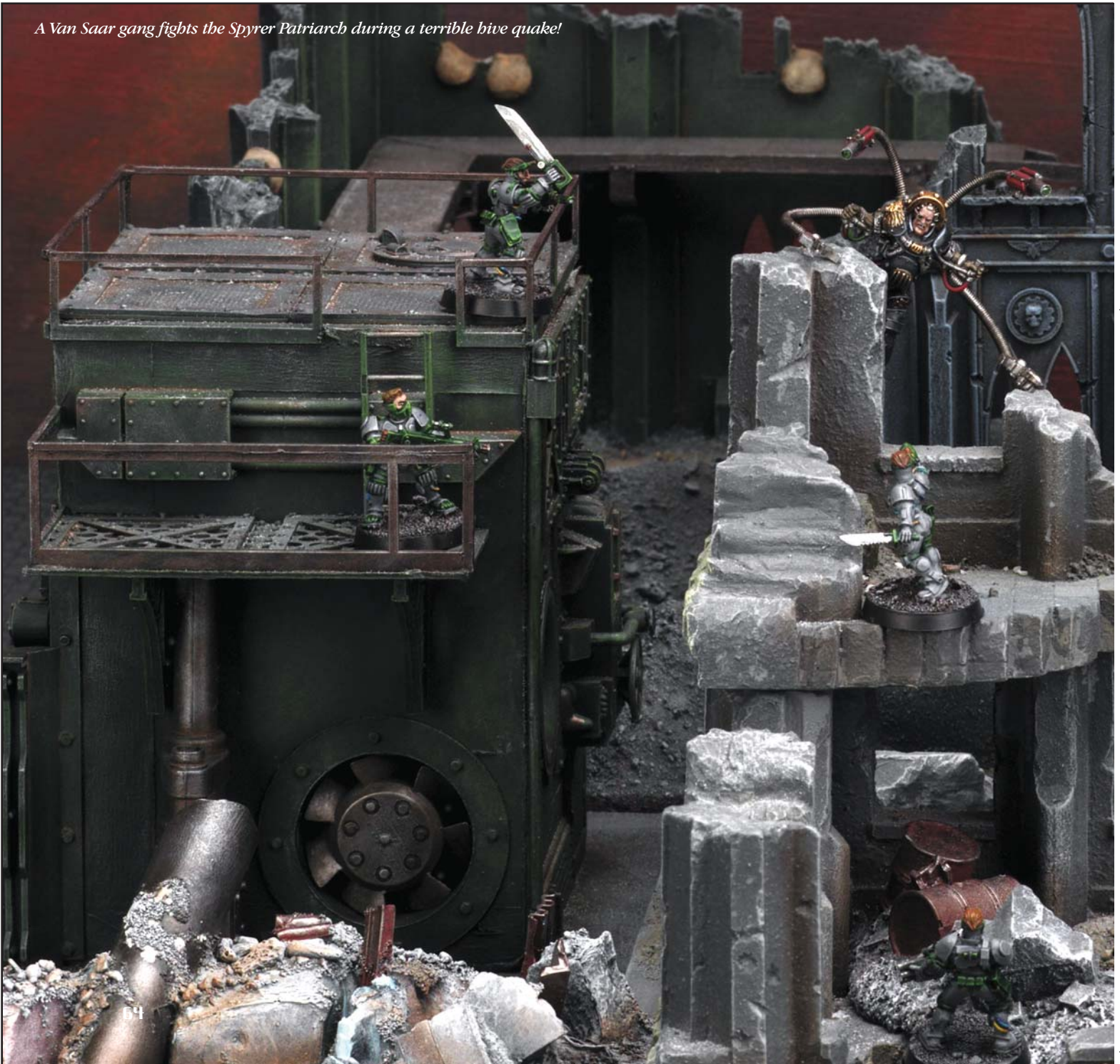
A Van Saar gang fights the Spyrer Patriarch during a terrible hive quake!

Noxious, sulphurous clouds of gas rising from waste chemicals pervade this area, making fighters choke and cough. Both players roll a D6 for each model at the start of the game. If the roll beats their Toughness (models with respirators or filter plugs get a re-roll) the model has been affected by noxious gas and stumbles around in a daze, fighting to remain conscious. Roll the Scatter dice to determine which way they stumble. Each model affected stumbles D3", if they fall they suffer damage as usual. Once the bullets start flying, fighters recover their wits sufficiently to ignore the gas so it has no further effect once the game is underway.