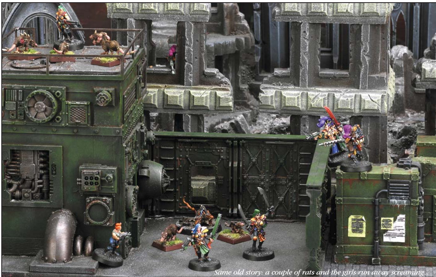
Same old story: a couple of rats and the girls run away screaming...