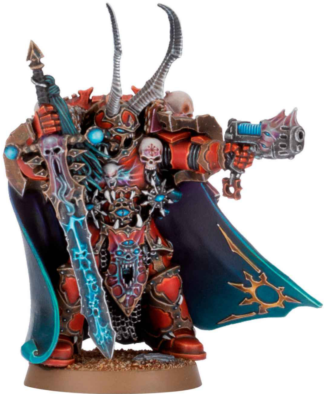
Kranon the Relentless, Chaos Lord