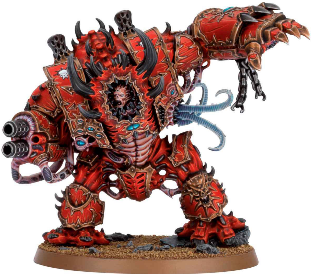
Mortis Metalikus, Helbrute