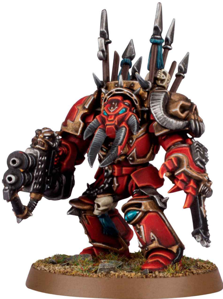
Chaos Terminator with heavy flamer and chainfist