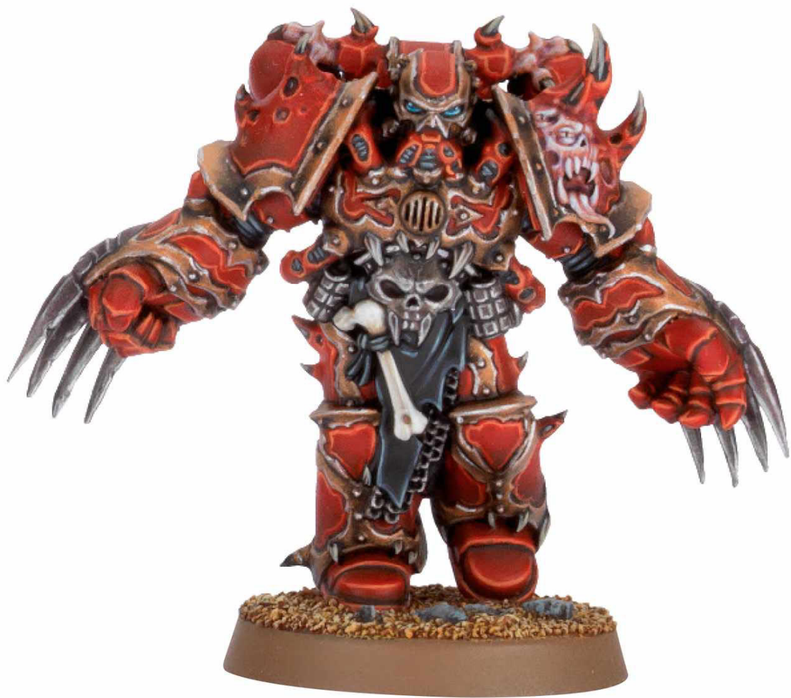
Chosen with lightning claws