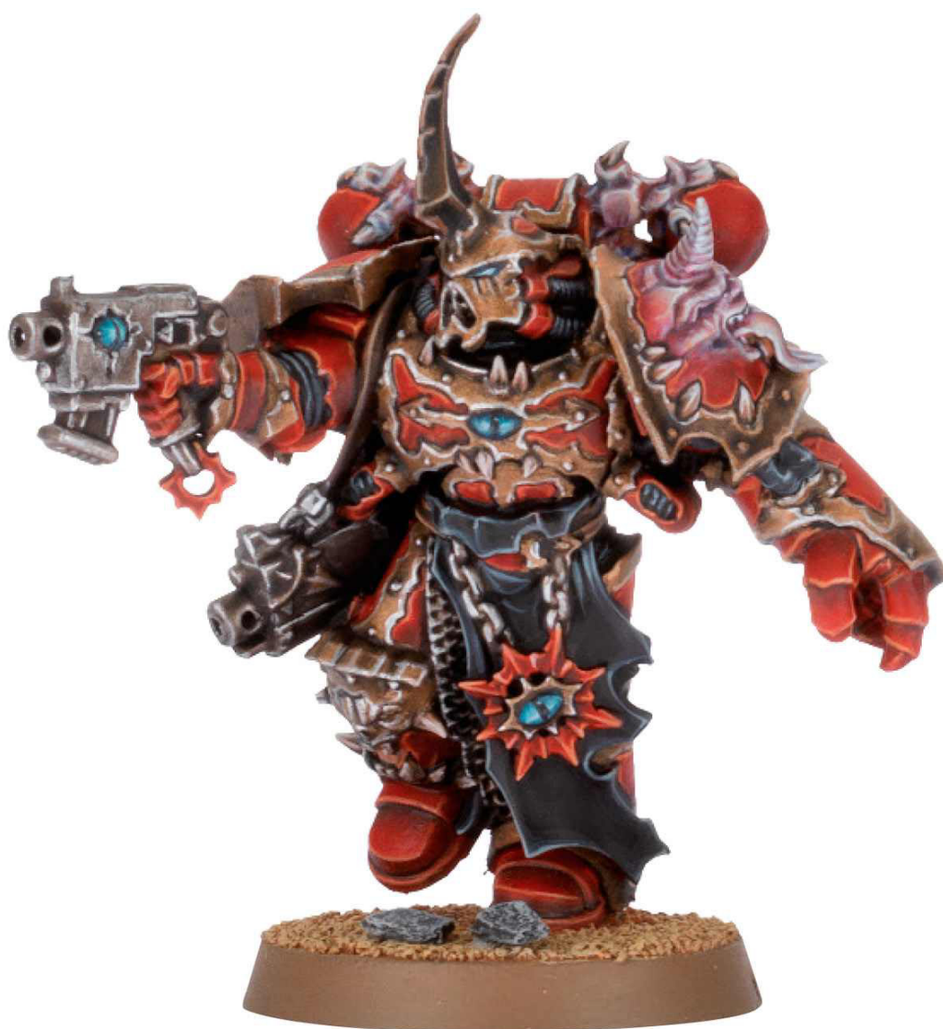
Chosen with power fist