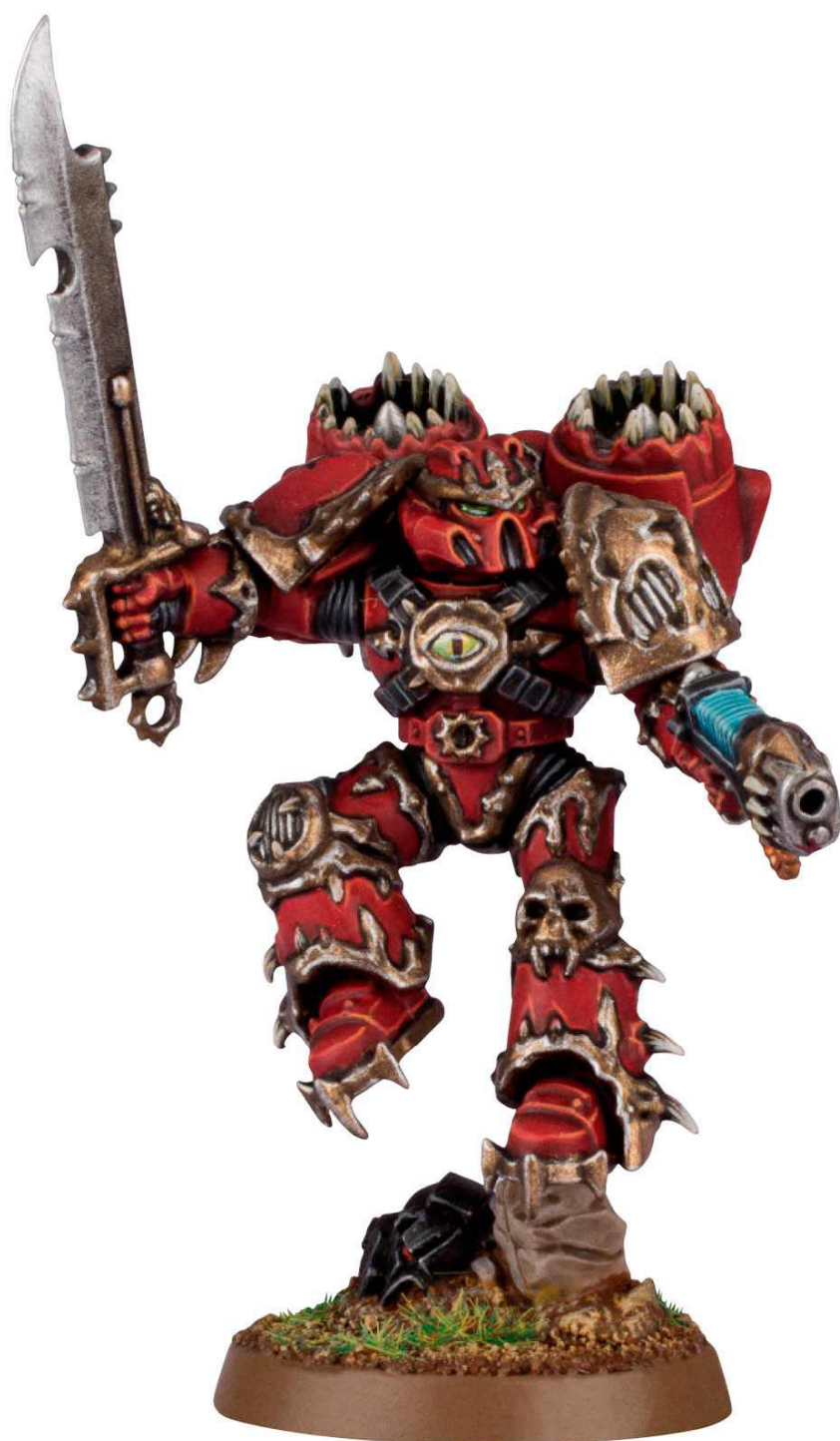
Raptor with power sword and plasma pistol