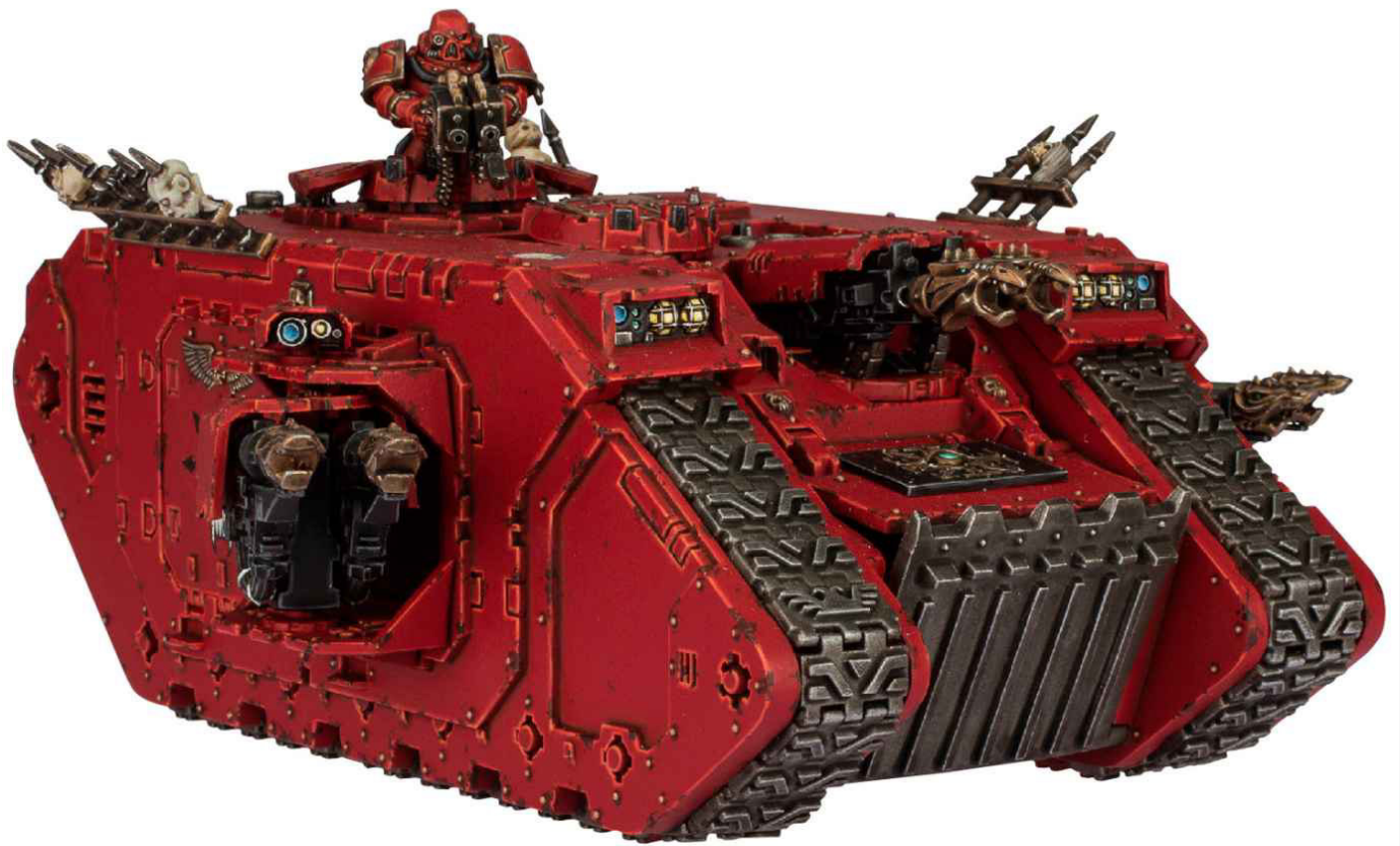
Chaos Land Raider