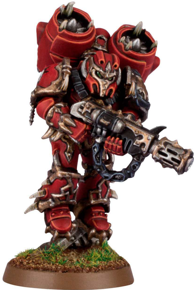
Raptor with meltagun