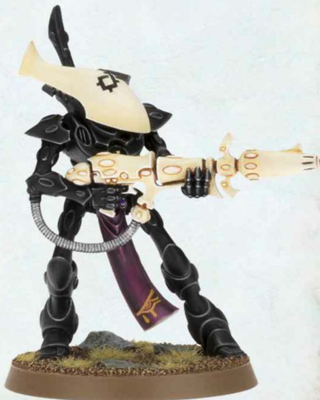
Biel-Tan Wraithguard with D-scythe and Ulthwé Wraithguard with wraithcannon