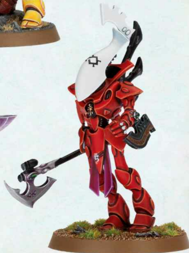
Iyanden Wraithblade with two ghostwords (top) and Saim-Hann Wraithblades (bottom)