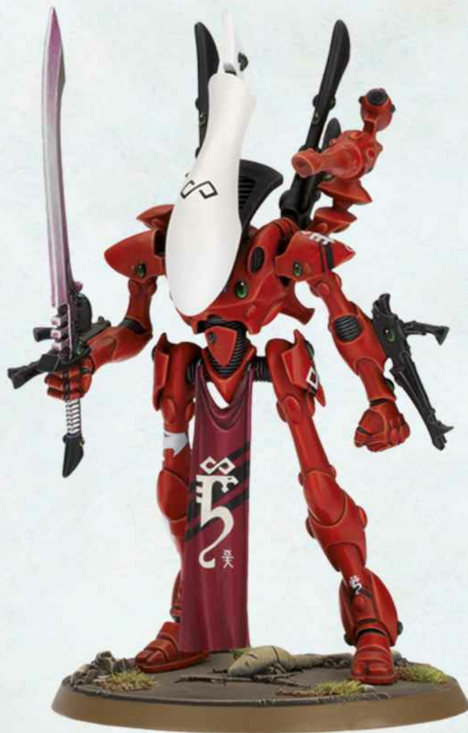
Saim-Hann Wraithlord with ghost glaive and bright lance