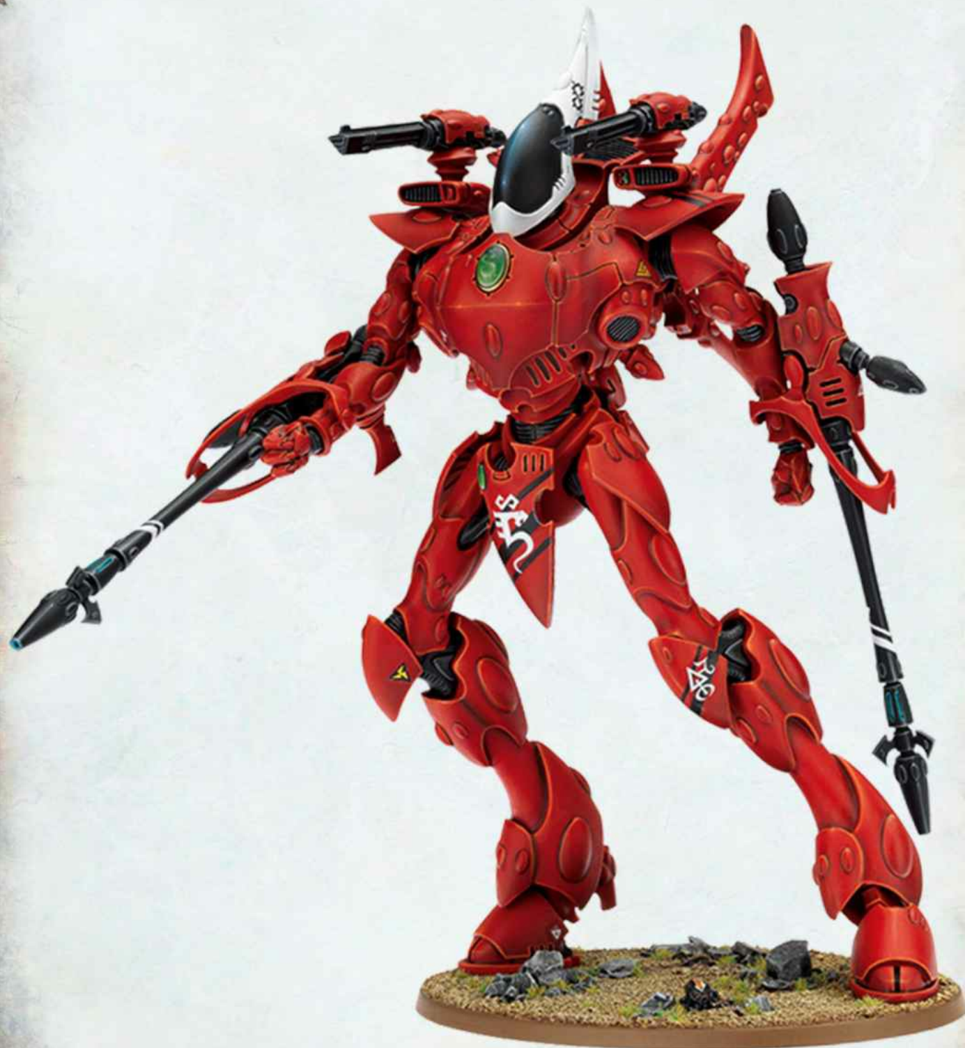
Saim-Hann Wraithknight with two heavy wraithcannons and two scatter lasers