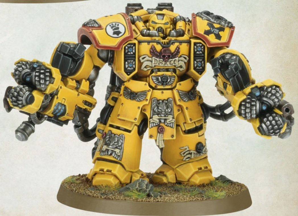
Assault Centurions with siege drills