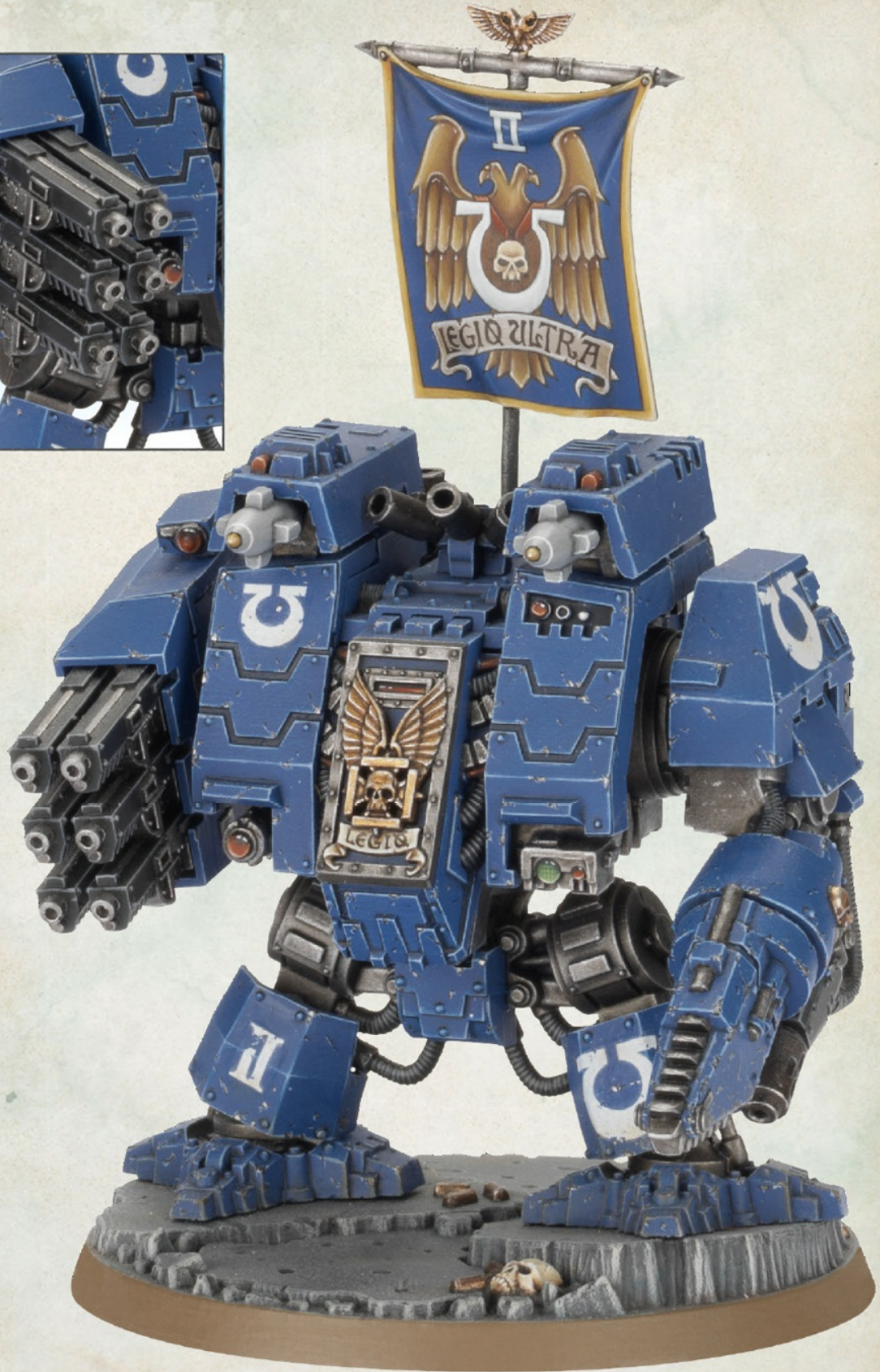
Ironclad Dreadnought with hurricane bolter and chainfist