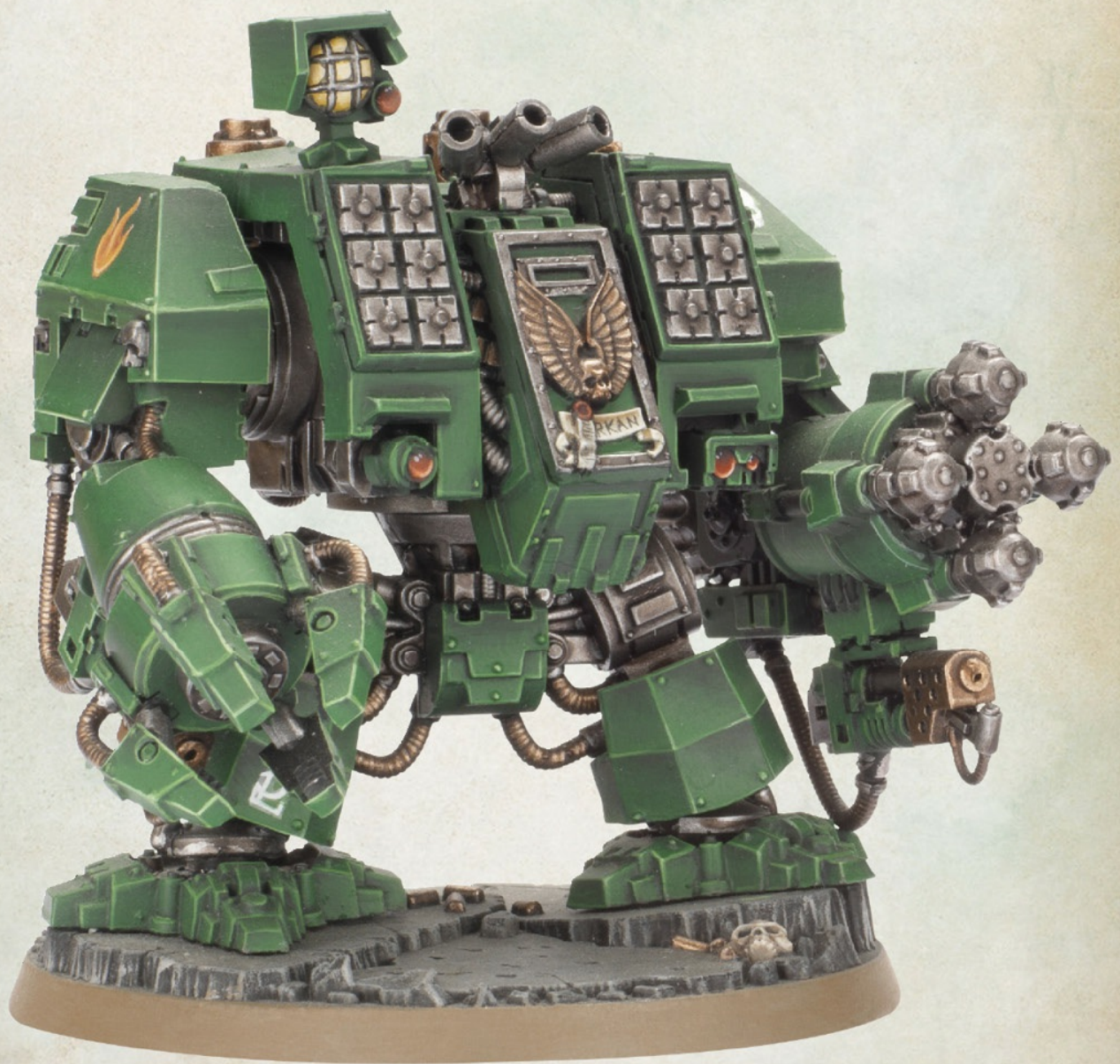
This Ironclad Dreadnought is armed with a power fist and seismic hammer.