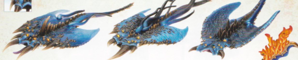
Screamers of Tzeentch