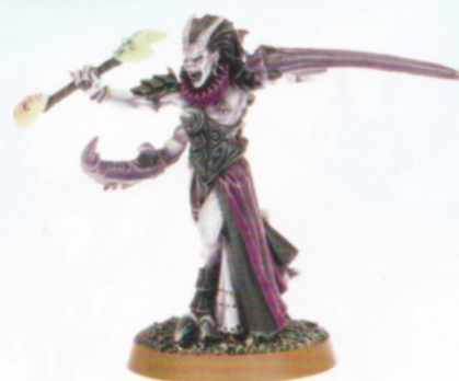
The Masque of Slaanesh