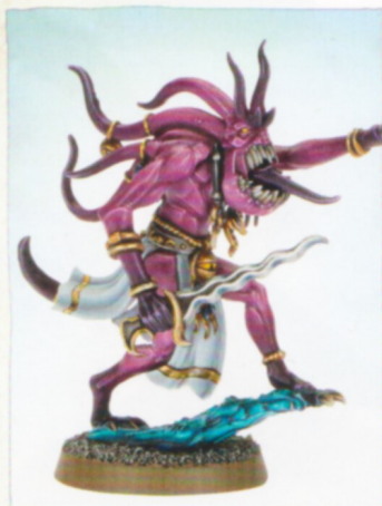
Herald of Tzeentch