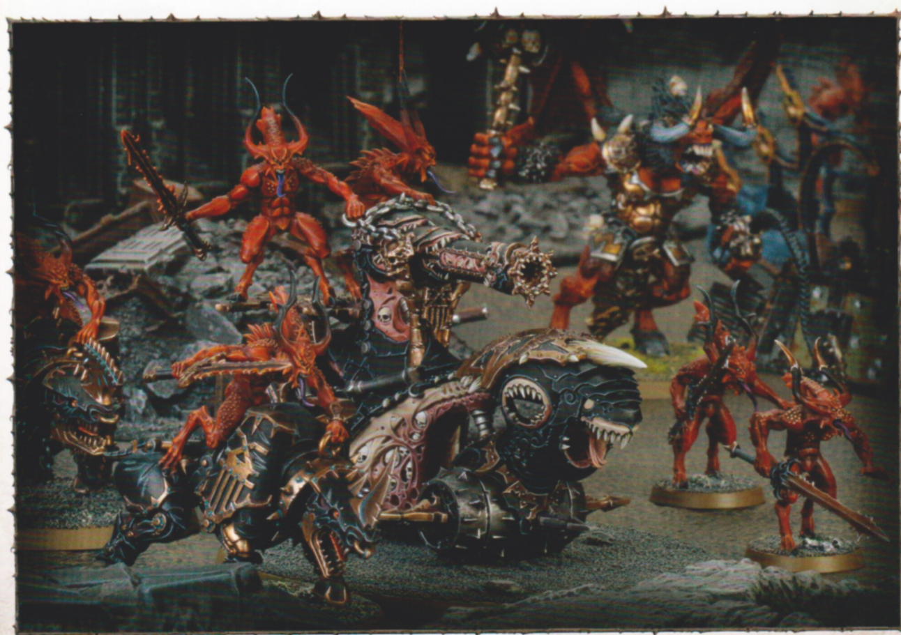
A Skull Cannon of Khorne growls towards the foe, its gruesome weapon spitting death.