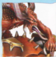
Bloodcrushers of Khorne