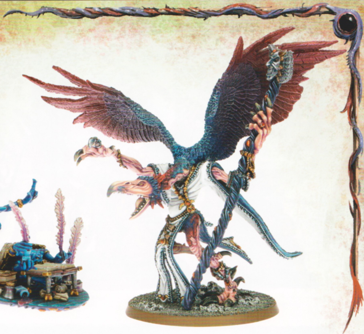
Lord of Change