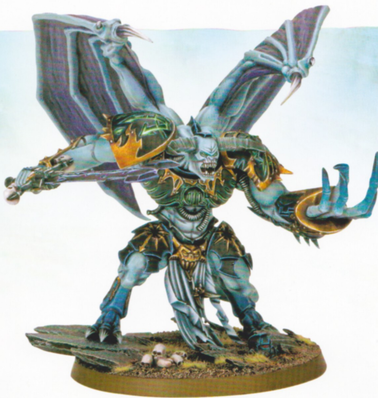
Daemon Prince of Tzeentch