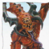
Herald of Khorne on Juggernaught