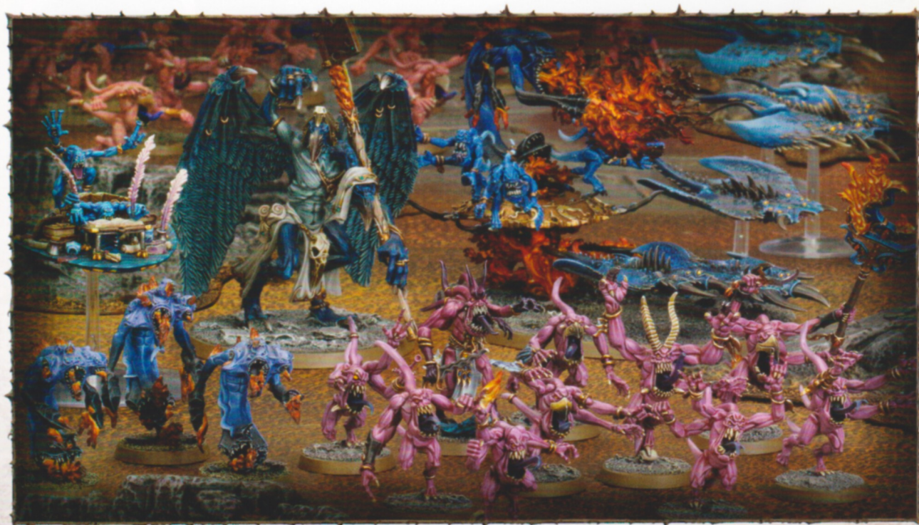
Mutagenic flame sears the air as the Daemons of Tzeentch twist reality to their own peculiar ends.