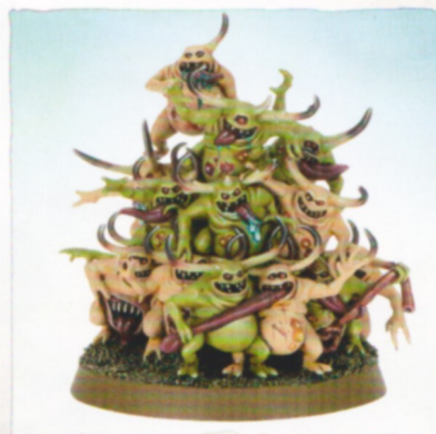
Plague Drones of Nurgle