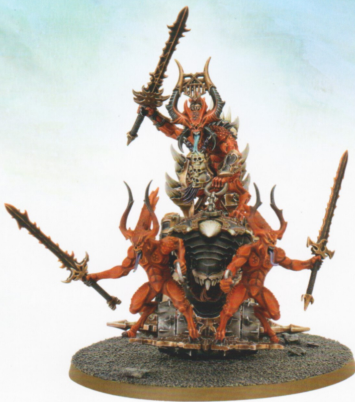
Blood Throne of Khorne