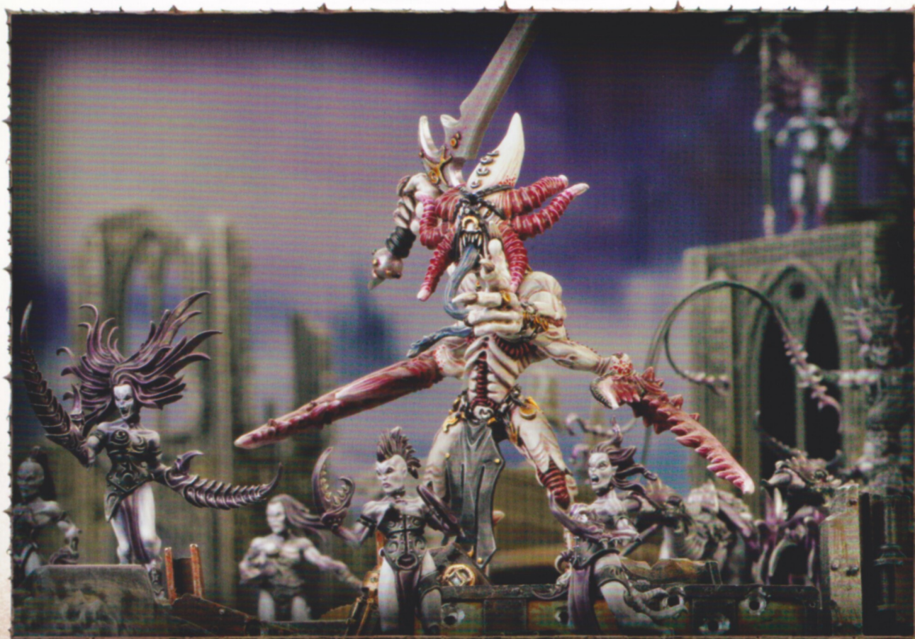
A Keeper of Secrets orders its Daemonette handmaidens to advance further into the city.