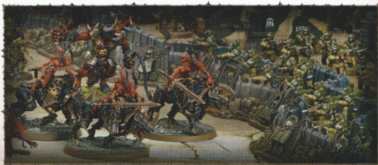
The brazen warriors of Khorne charge headlong into the trenchlines of their Imperial Guard prey.