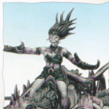
Exalted Seeker Chariot of Slaanesh