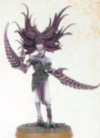
Daemonettes of Slaanesh