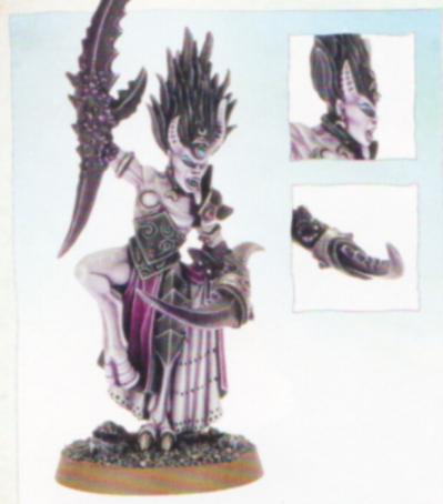
Herald of Slaanesh