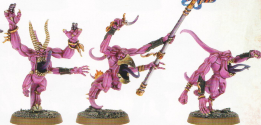
Pink Horrors of Tzeentch