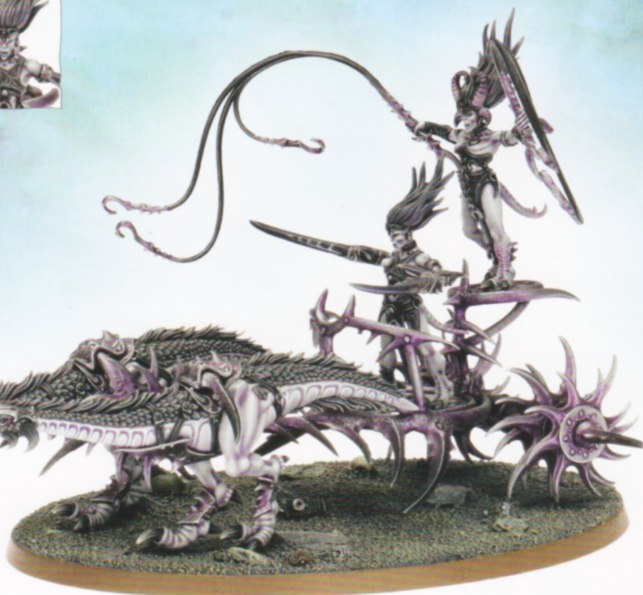
Seeker Chariot of Slaanesh