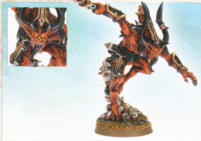
Herald of Khorne