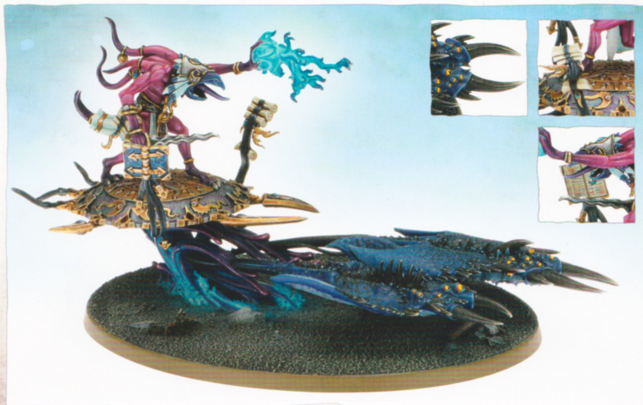
Herald of Tzeentch on Burning Chariot