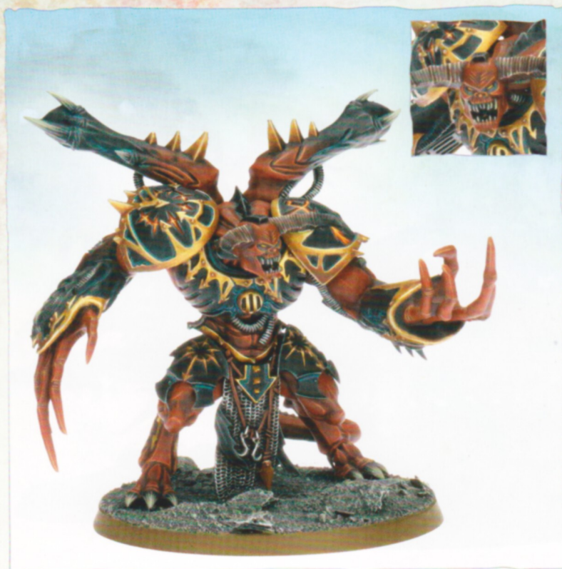
Daemon Prince of Khorne