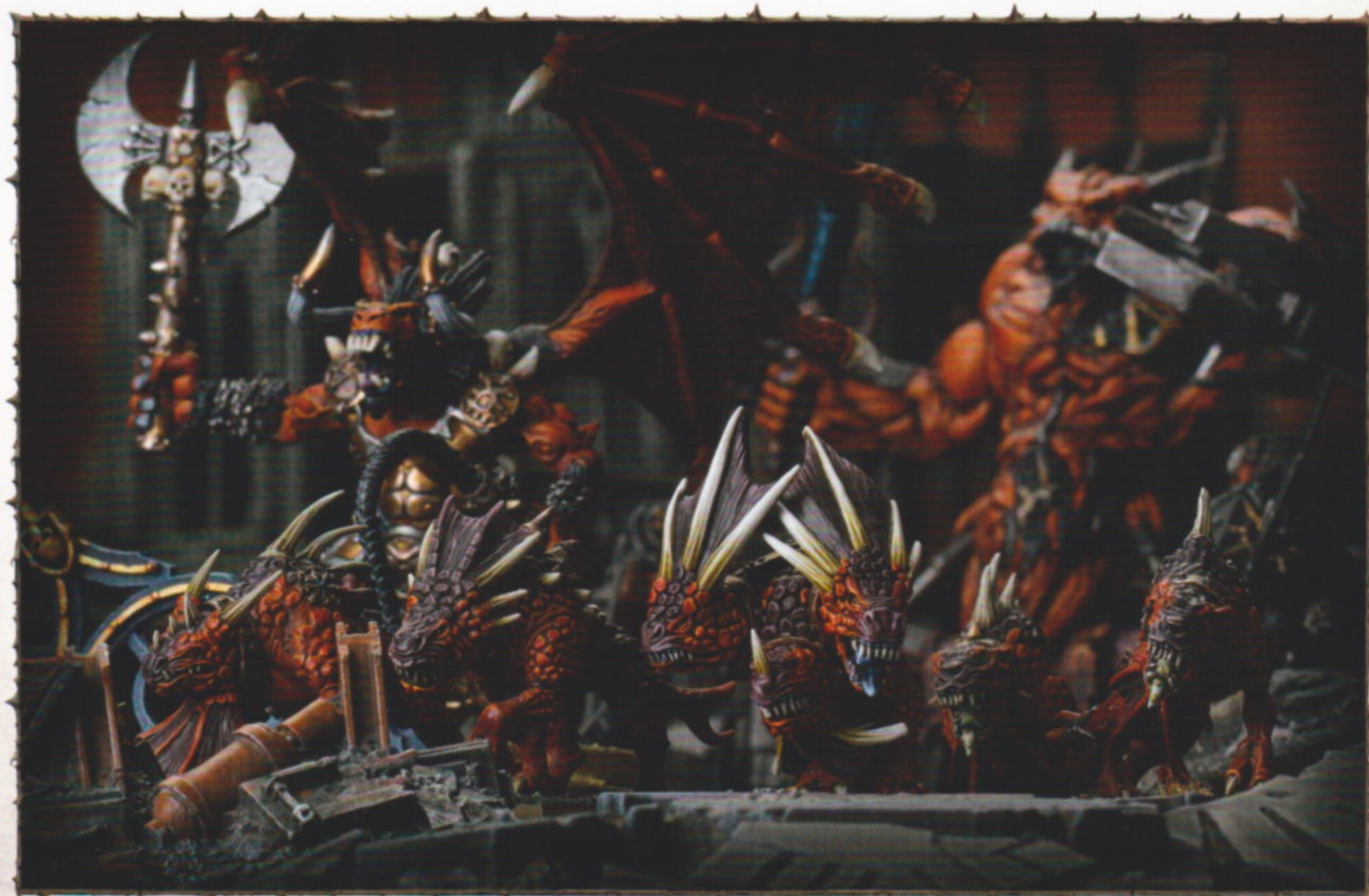
Karanak and his Flesh Hounds prowling the shattered ruins, monsters storming forwards in their wake.