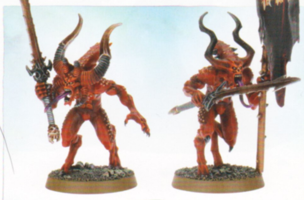
Bloodletters of Khorne