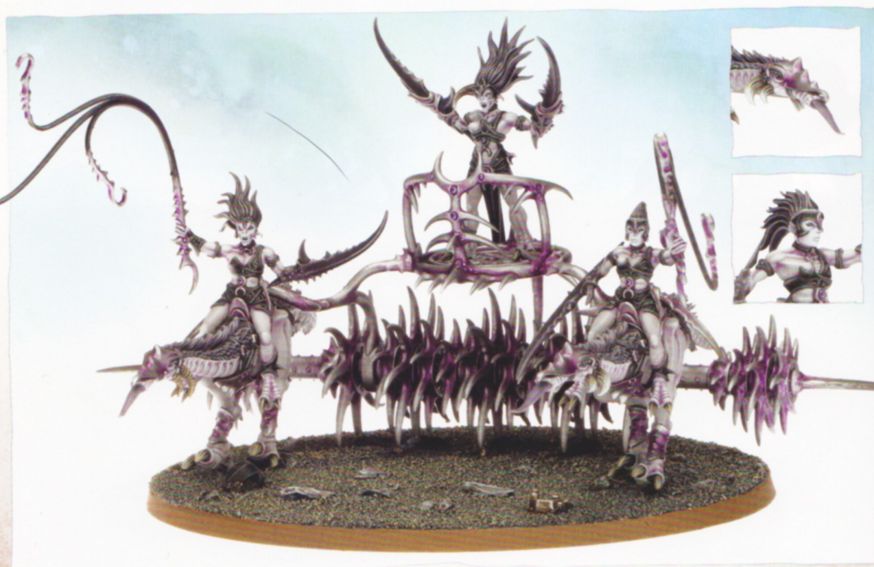
Hellflayer of Slaanesh