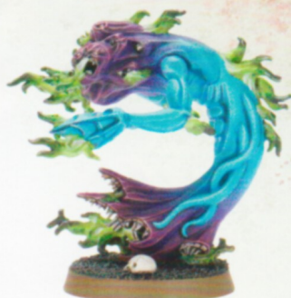
Flamers of Tzeentch