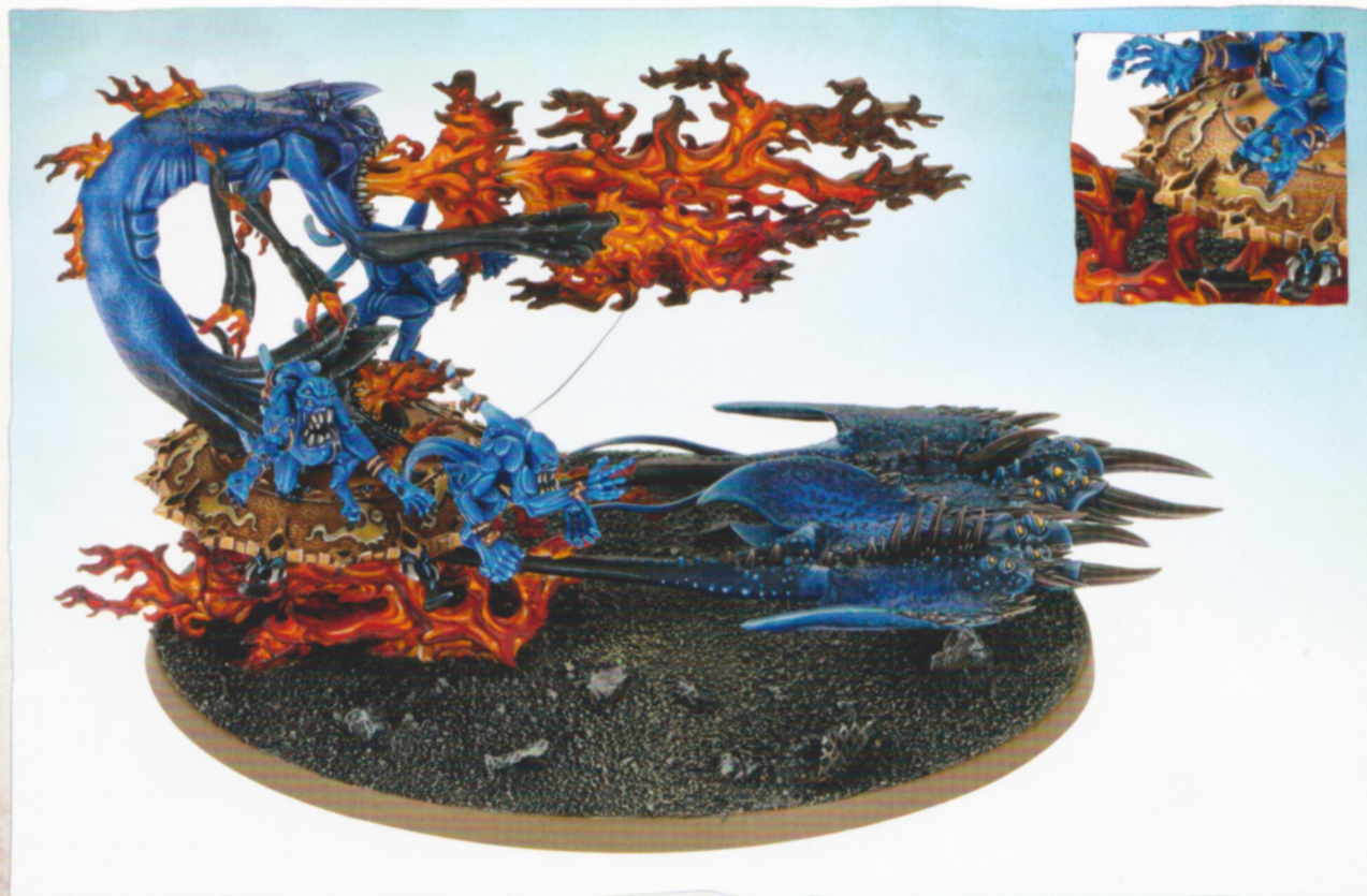
The Burning Chariot of Tzeentch