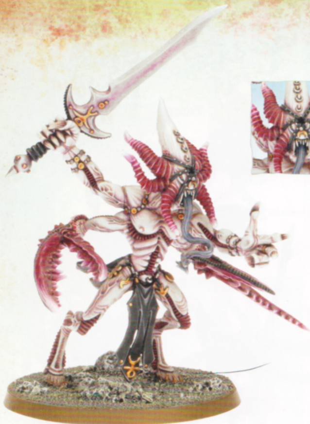
Keeper of Secrets