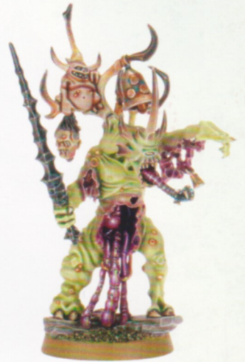
Herald of Nurgle