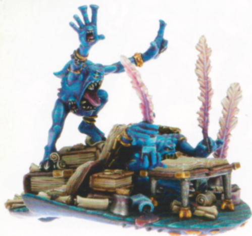
The Blue Scribes