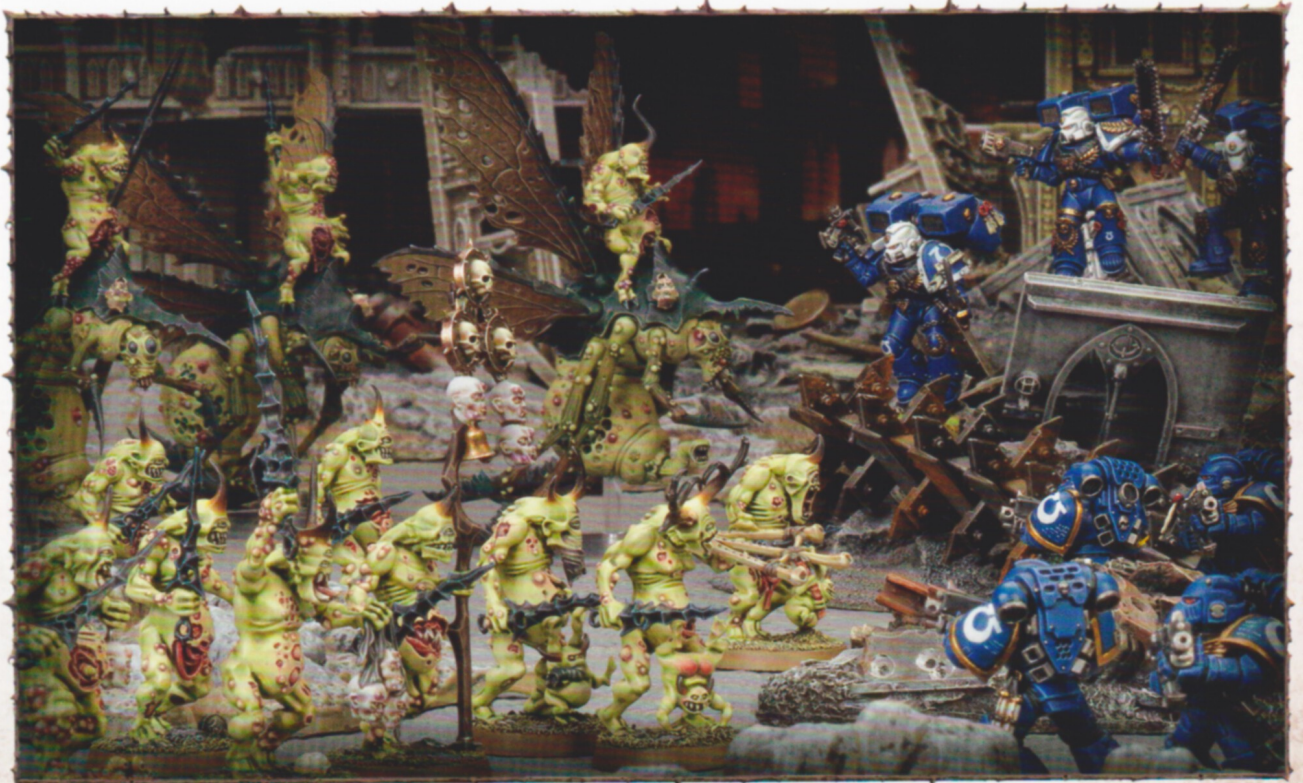
A chanting horde of Plaguebearers and Plague Drones falls upon its Space Marine foes.