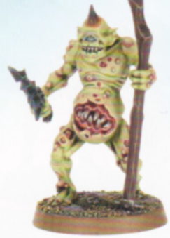
Plaguebearers of Nurgle