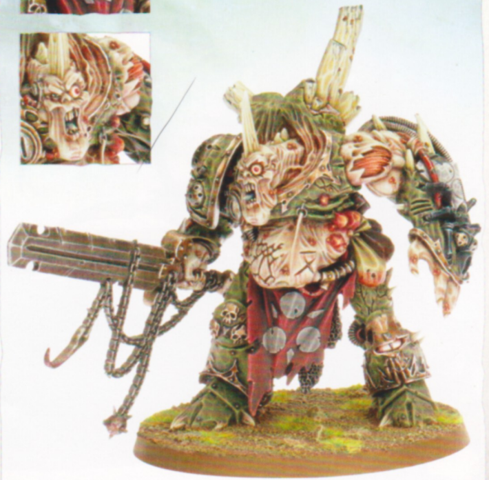
Daemon Prince of Nurgle