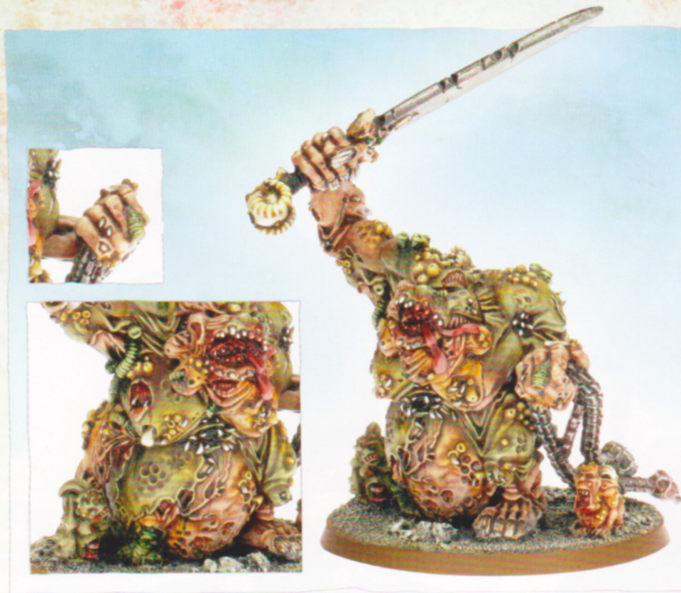
Great Unclean One