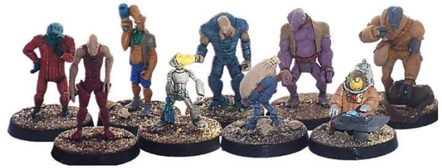
"The Usual Suspects."