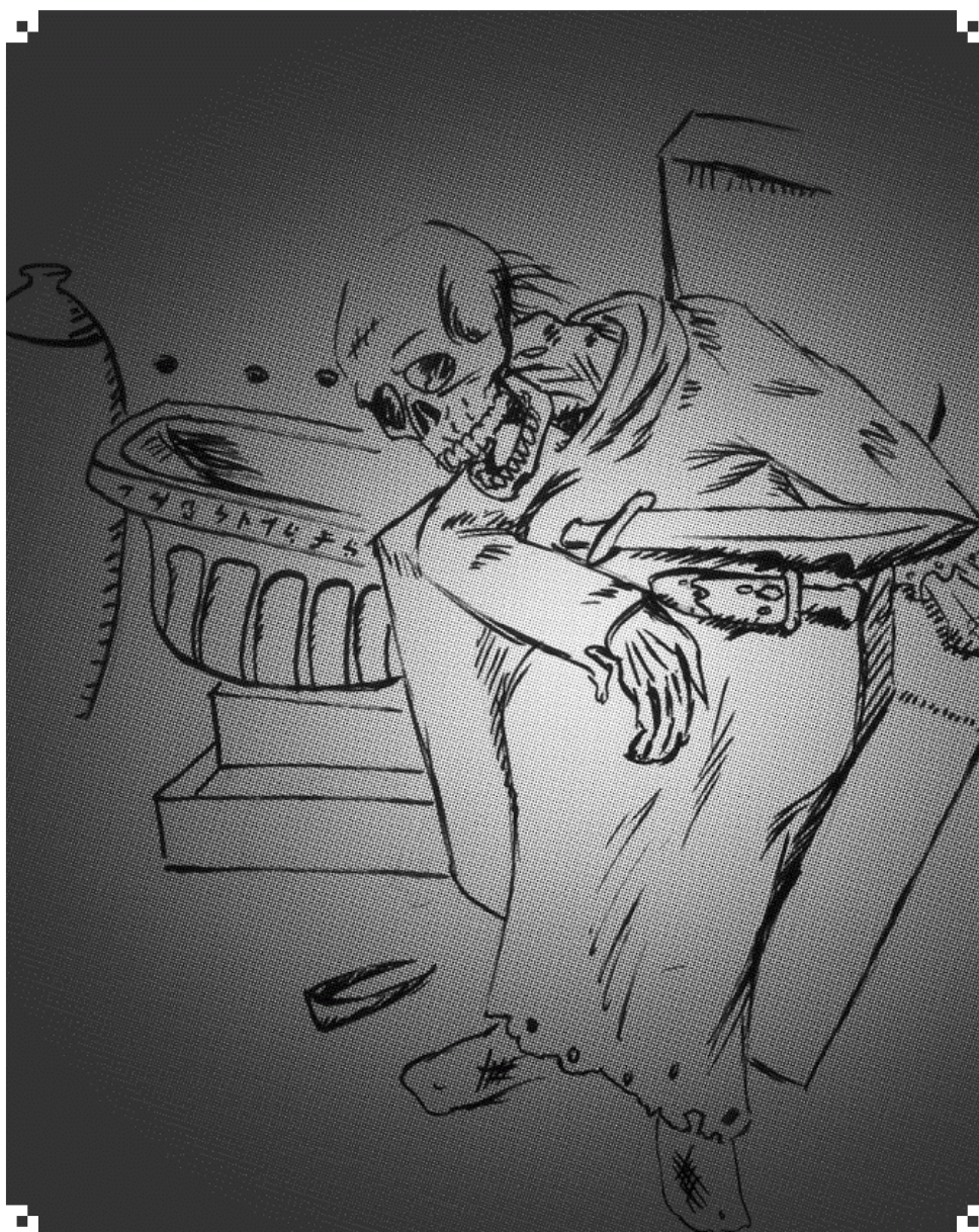
Corpse King by Claytonian JP