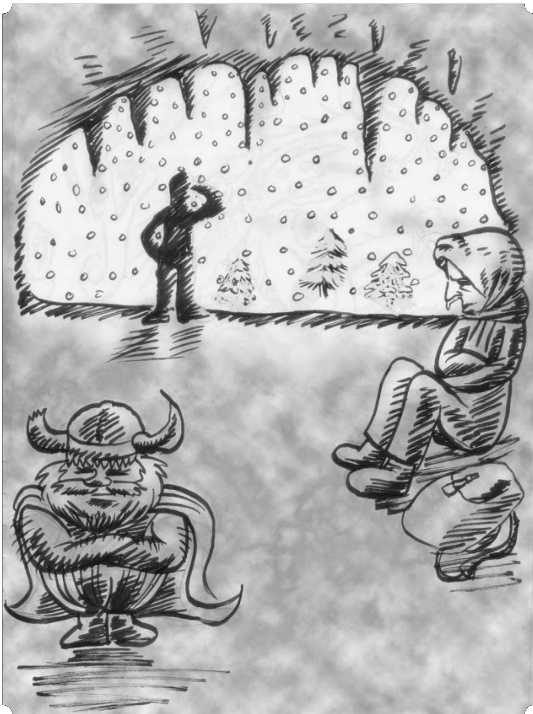
Cold Adventuring Party by Claytonian JP

This PDF is dedicated to all Old School, New School and awesome DIY Players and GMs out there across the globe.