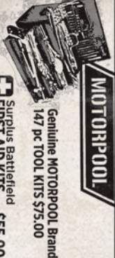
MOTORPOOL Genuine MOTORPOOL Brand 147 PC TOOL KITS $75.00 Surplus Battlefield FIRST AID KITS.....$55.00