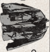
"Lightly Used" GOVERNMENT SURPLUS FLAK JACKETS While Supplies Last $99.99