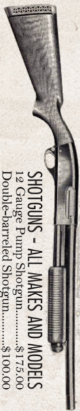
SHOTGUNS - ALL MAKES AND MODELS 12 Gauge Pump Shotgun.....$175.00 Double-barreled Shotgun.....$100.00