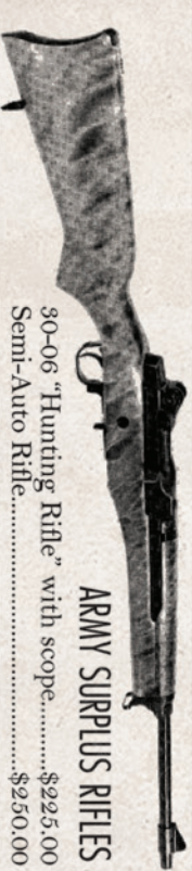
ARMY SURPLUS RIFLES 30-06 "Hunting Rifle" with scope.....$225.00 Semi-Auto Rifle.....$250.00