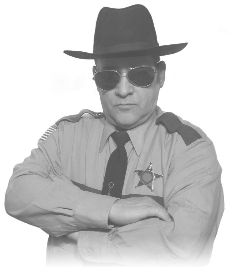
At their heart, stories are about status. Play with status and let it drive your game.