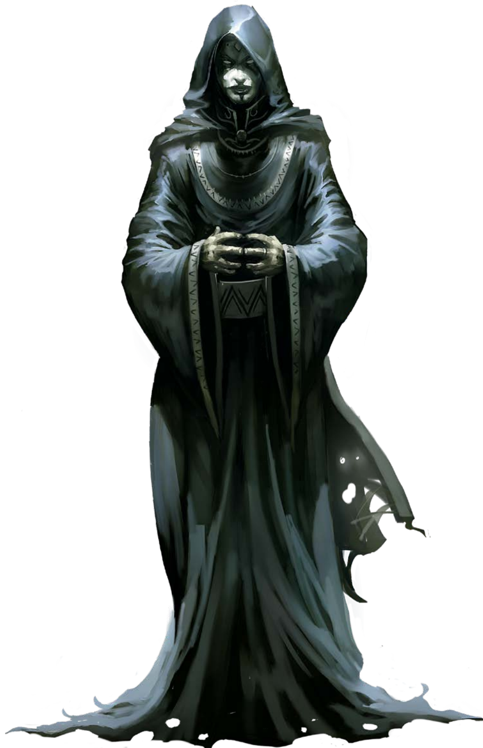
PRIEST OF RAZMIR