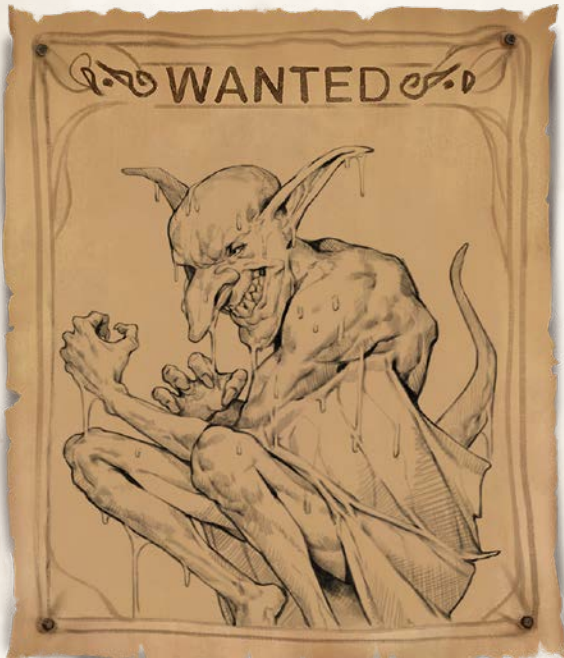
Mephit Bounty Poster