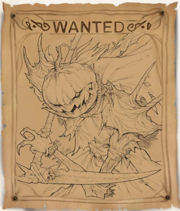
Scarecrow Bounty Poster