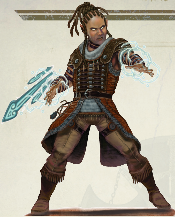
Table 2-1: Legendary Kineticist Advancement