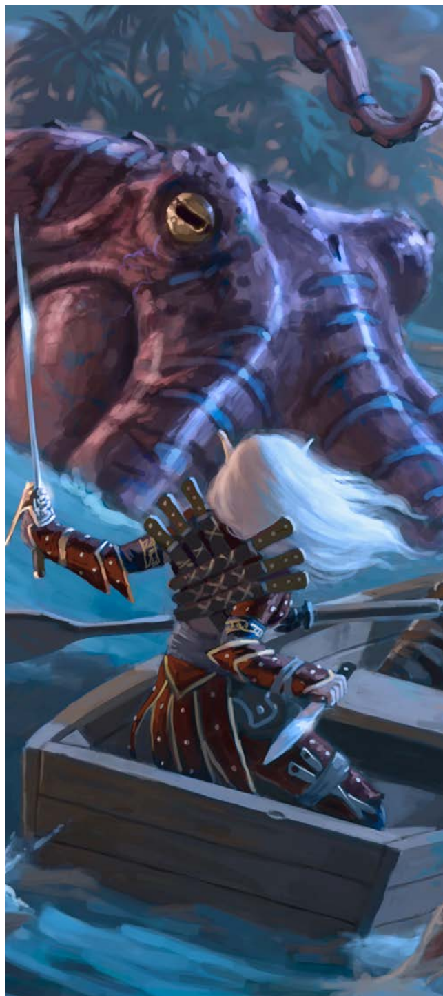
Illustration by Craig J Spearing