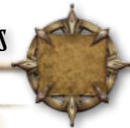
TABLE 6-1: COMBAT FEATS