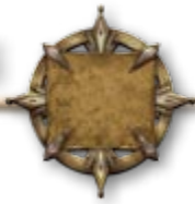
TABLE 12-1: ENCOUNTER DESIGN