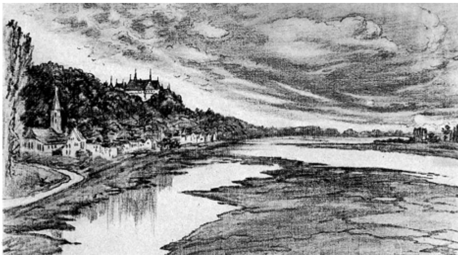
Sleepy Hollow near the Hudson River

Capsule: Abraham (or “Brom Bones” as he is more commonly called in Sleepy Hollow), is a bit of a local hero. He is regarded as the strongest, bravest, most able-bodied young man in the village and he knows it. He is quite likable in spite of his own arrogance, though he does not take well to those who would challenge his superiority. He is expected by all in town to marry the beautiful young Katrina Van Tassel and takes particular offense at other suitors who would challenge his claim to her hand.