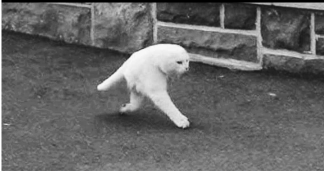
THE LONGER YOU LOOK THE WEIRDER IT GETS

*SPECIAL MOVE* WHEN YOU TAKE AN OPPORTUNITY TO PROVE WHAT YOU'VE LEARNED TO SOMEONE ELSE, THEY RECEIVE A TOKEN.