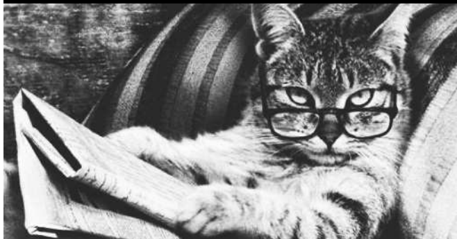
WELL IF IT AIN'T THE MUTT'S NUTS

*SPECIAL MOVE* WHEN YOU ACCEPT THE SUPPORT OF SOMEONE STRONGER, YOUR NEXT STRONG MOVE DOES NOT COST A TOKEN.