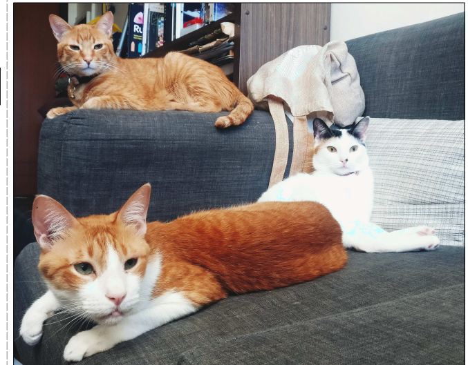
♥ FROM TOP TO BOTTOM: MERLIN (THE MASTERMIND), CASSANDRA (THE HALF CAT), AND CHASSIS (THE POLITE CAT) ♥