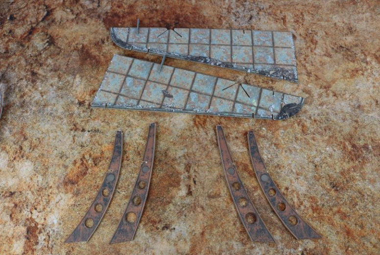
Front roof piece.

Attach two straight clips to roof floor panels