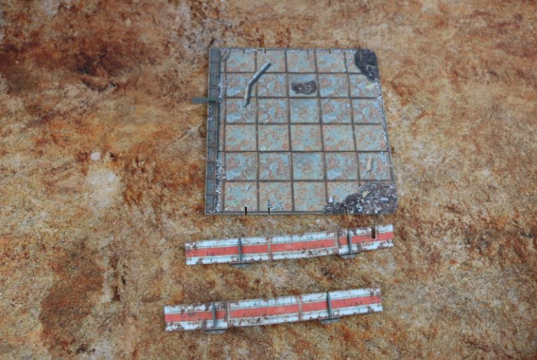
Back roof piece.

Attach straight clip to roof piece. Attach 90 degree clips to side pieces.