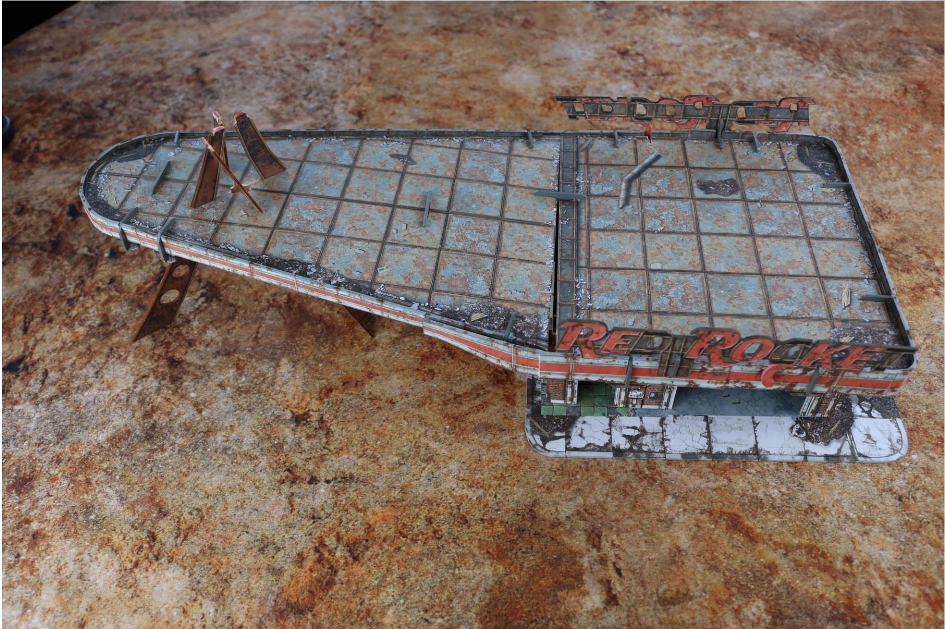
Finished Red Rocket – no resin parts added