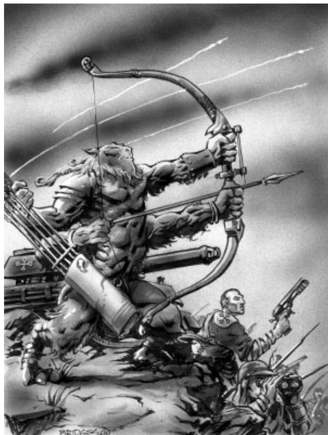
A Vorox at war

Vorox: Huge carnivorous, multi-limbed beasts, the Vorox are new to civilization. That they achieved sentience