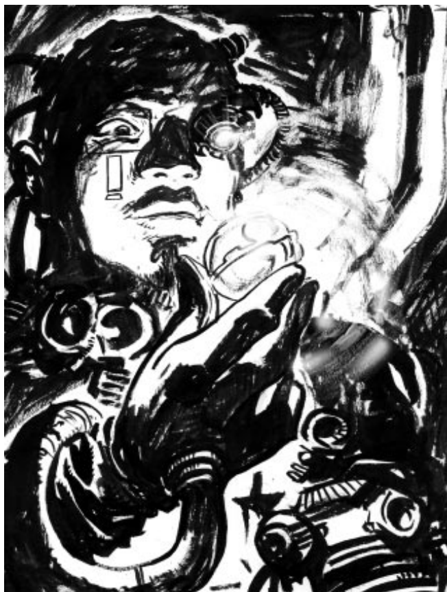
An Engineer makes a discovery...

the guise of a salvage and reclamation guild. Since they possess blackmail on just about every major official — even bishops — little is done against them.