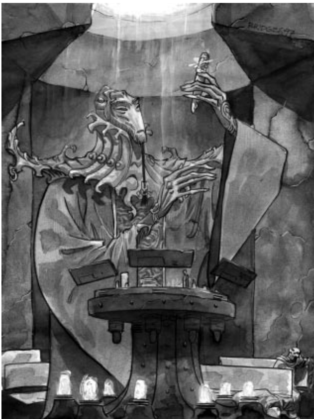
A Vau mandarin

So, what kind of character do you want to play? In Fading Suns , the choice is up to you. Your character’s abilities are not subject to the whim of fickle dice — Fading Suns players can choose what traits their character possesses. Each