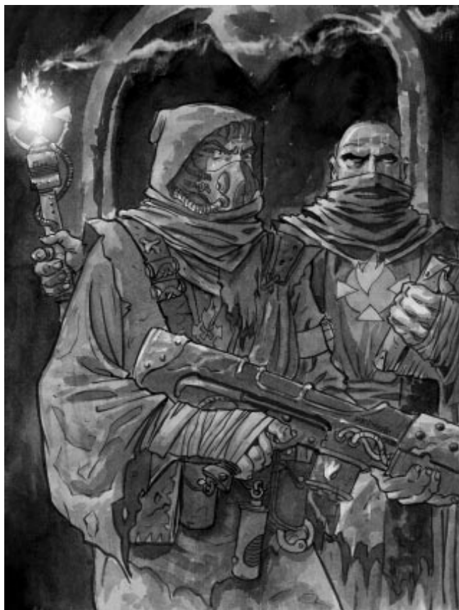
Temple Avesti inquisitors

Temple Avesti: Dreaded inquisitors. The Avestites long ago seized most of the seats on the Inquisitorial Synod, and have since then made it their duty to search the Known Worlds for signs of heresy, demonism and any other threat to the faithful. Their illiteracy, fear of learning and dogmatic adherence to certain extreme scriptures makes them feared and hated throughout Human Space. But they are obeyed