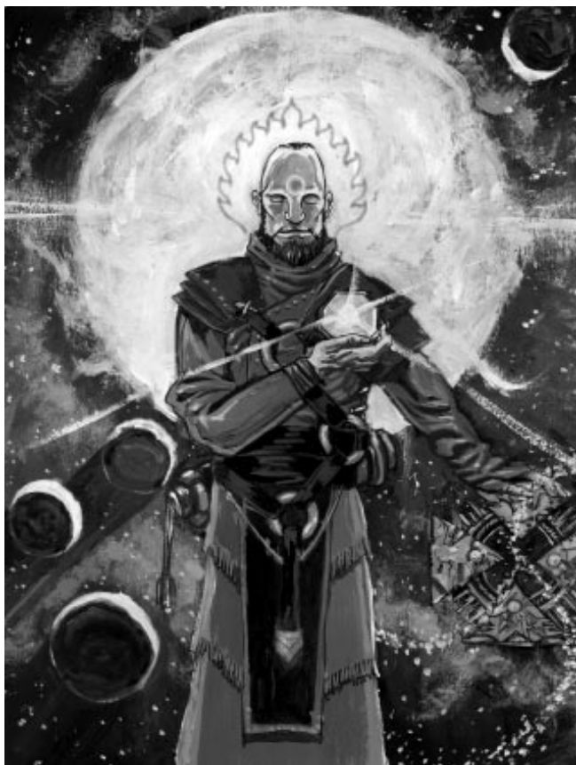
Zebulon the Prophet

By the time the truth behind the Shantor's rage was discovered, it was too late to reform the beasts in humanity's eyes: the "dangerous and uncontrollable" Shantor were enslaved and moved to reservations across the Known Worlds, breaking up their families and culture.