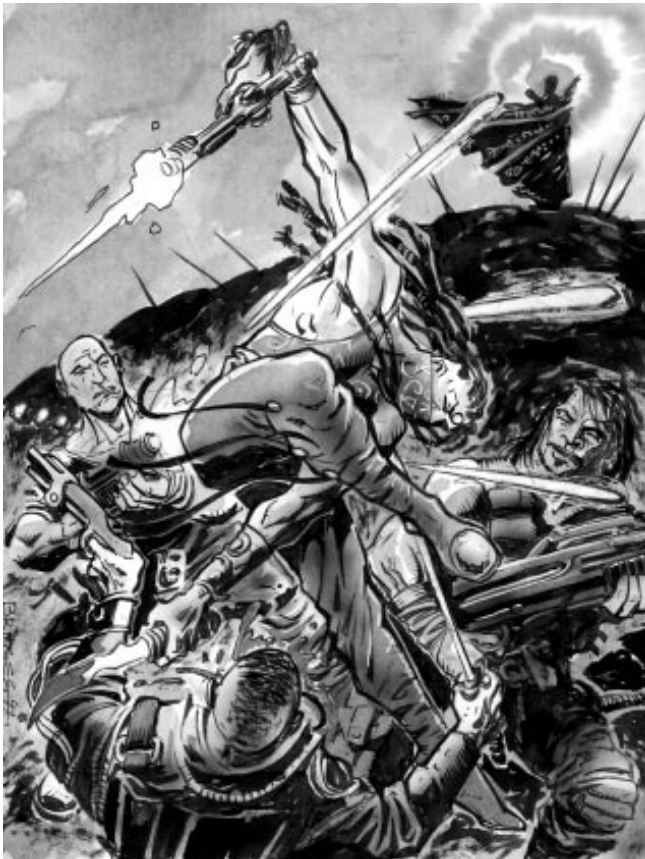
The heat of battle...

the number of successes scored. These successes can be used directly to gauge how poorly or how well a character succeeded in a task: the more successes, the better the character did at the task. However, the number of possible successes (from 1 to 18*) leaves a lot of room for interpretation. For some situations, such as rolls to determine weapon damage or how well a complementary skill aided in another person's task, a smaller scale is more useful. To make things a little easier, Fading Suns successes translate directly into "victory points," which can be calculated by consulting the Victory Chart (above). For most actions, the player can simply consult the Victory Chart to determine the level of success. One victory point is minimal — the character squeaked