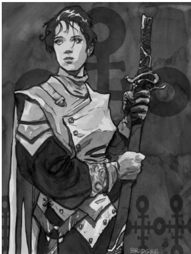
A noble of House Li Halan...

Brother Battle: This order of monk knights is the most