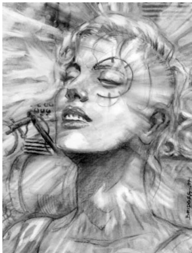
Experiencing the Sathra Effect

The chronicle of humanity's history among the stars is a long one, stretching over two millennia. It is not a quiet