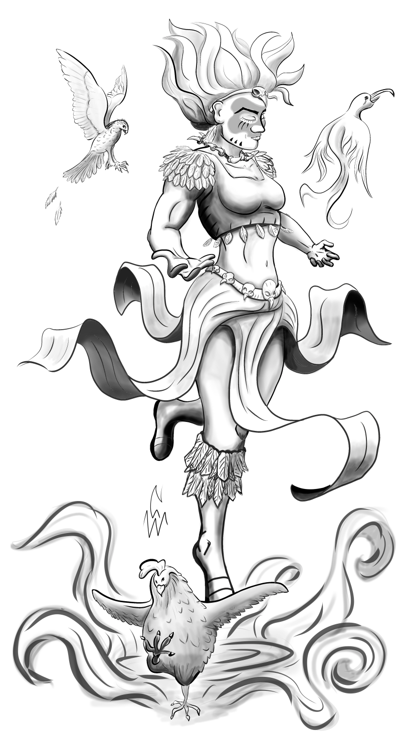
7 — 13