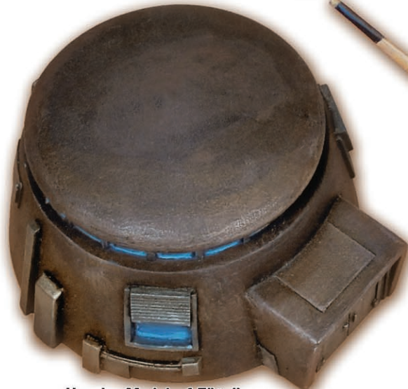
Housing Module: 1.5" tall