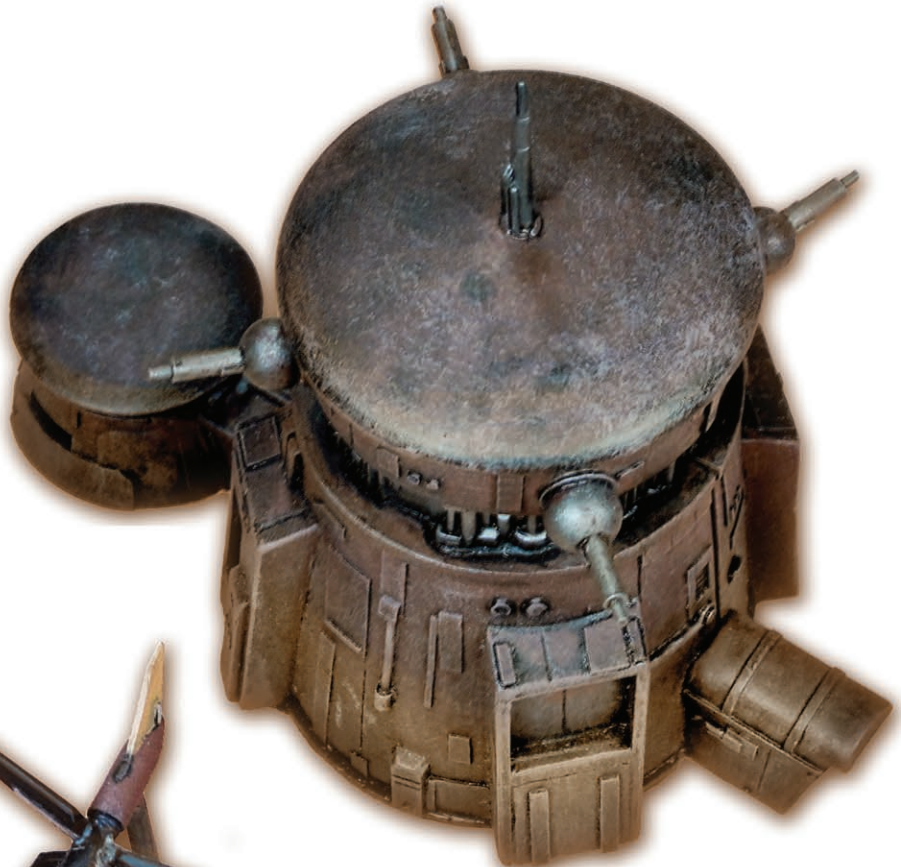
Outpost: 3" tall