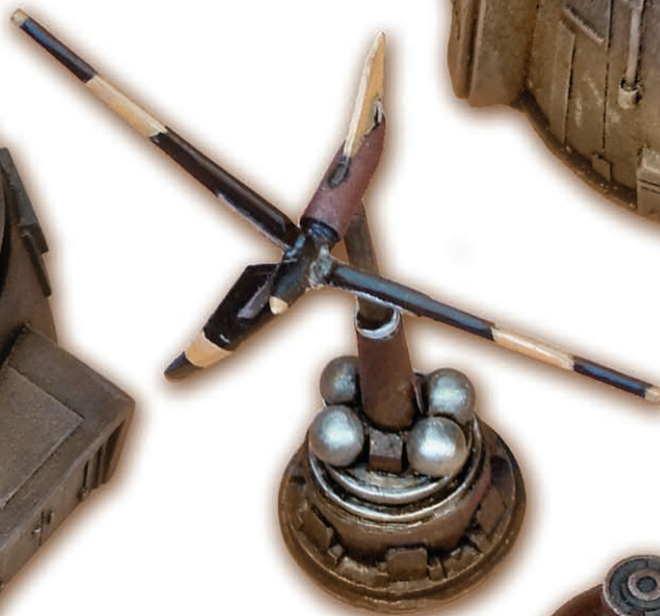
Windmill: 2.5" tall