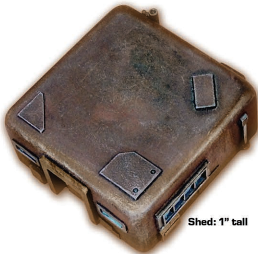
Shed: 1" tall