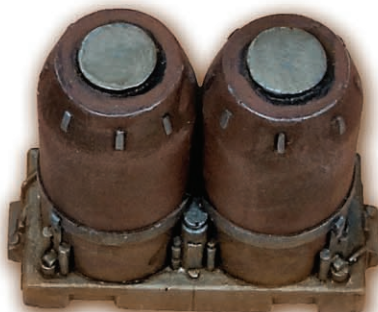
Water Tanks: 1.5" tall