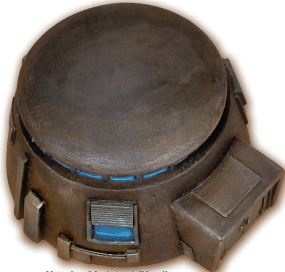
Housing Module: 1.5" tall