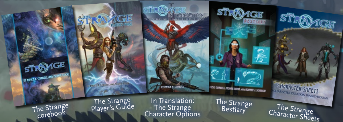
The Strange corebook