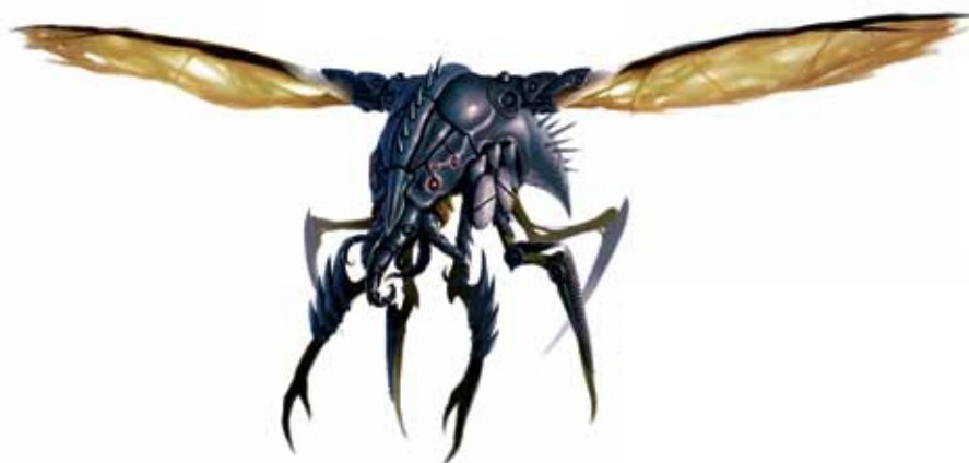
SECA-2 MEDIUM SEALED COMBAT ARMOR