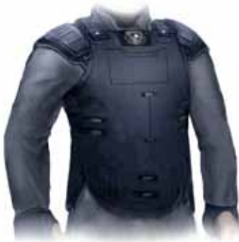
SENTRYTECH MK-IV LIGHT CONCEALABLE ARMOR