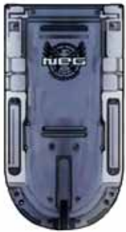
PHALANX II SECURITY SHIELD (HAND HELD KEVTECH COMPOSITE POLYMER SHIELD)