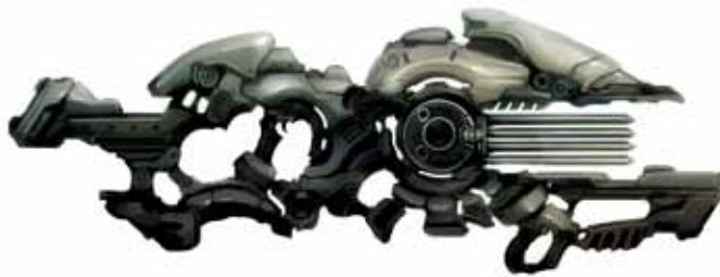
DEEP ONE NEEDLER RIFLE