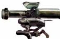
RPG-11 ROCKET LAUNCHER