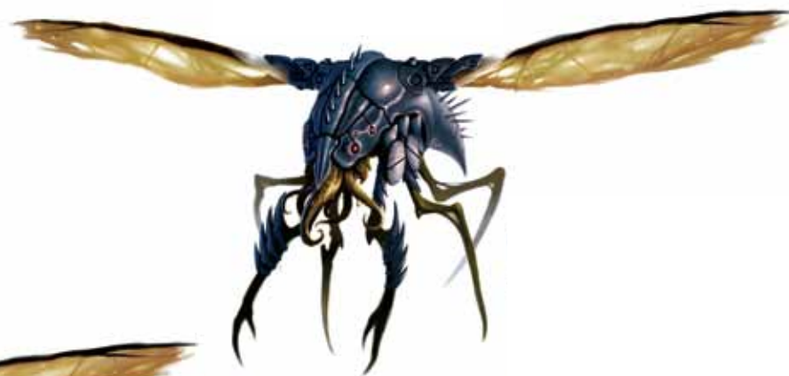
SECA-1 SEALED COMBAT ARMOR