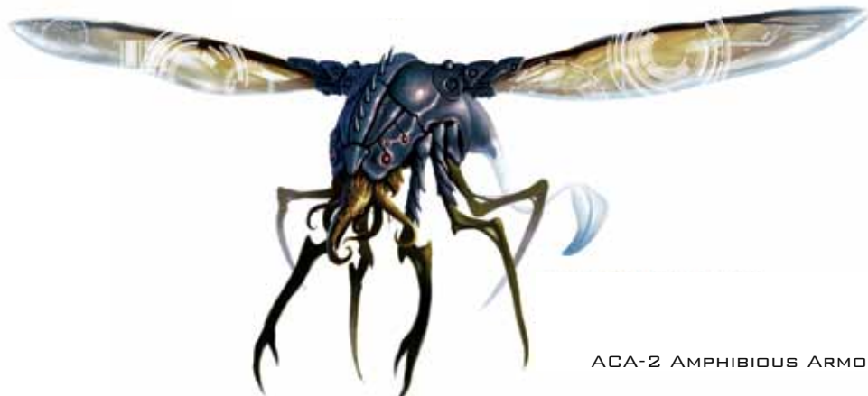
ACA-2 AMPHIBIOUS ARMOR