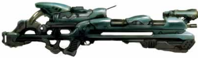
DEEP ONE SNIPER RIFLE