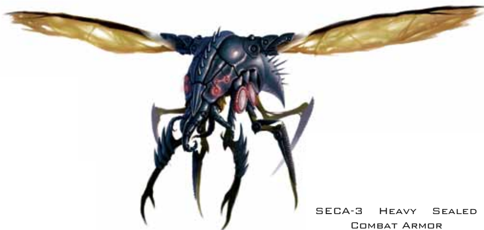
SECA-3 HEAVY SEALED COMBAT ARMOR