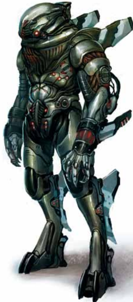
DEEP ONE HEAVY ARMOR