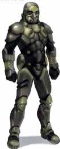
SPECTRASHIELD LIGHT SPECTRA FIBER COMBAT ARMOR W/LIGHT TRAUMA PLATE