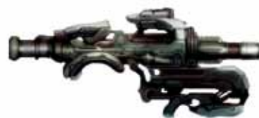
RPG-27 ROCKET LAUNCHER