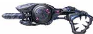
AMRL ANTI-MATTER MISSILE LAUNCHER