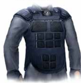
SENTRYTECH MK-V HEAVY CONCEALABLE ARMOR VEST W/TRAUMA PLATES