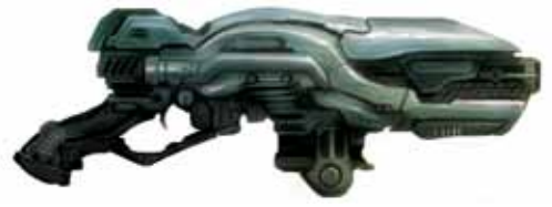
DEEP ONE SCATTERGUN