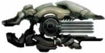
DEEP ONE NEEDLER POD