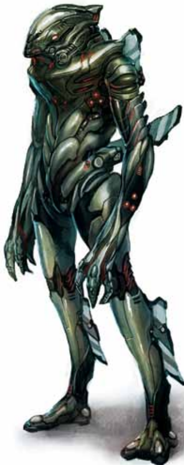
DEEP ONE LIGHT ARMOR