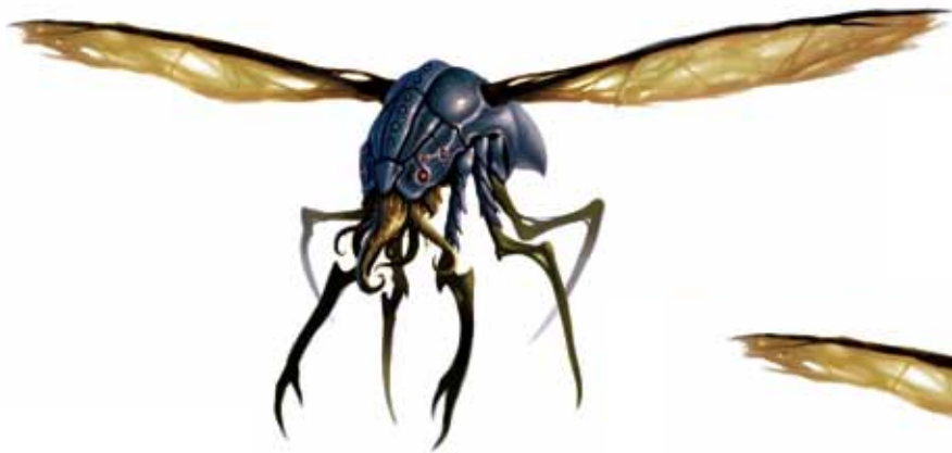
LBA-1 LIGHT BALLISTIC ARMOR