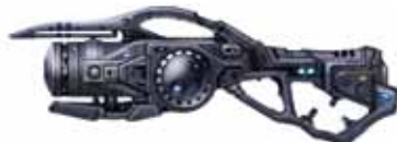
AMRL ANTI-MATTER MISSILE LAUNCHER