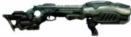
DEEP ONE STUNNER