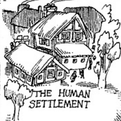
THE HUMAN SETTLEMENT