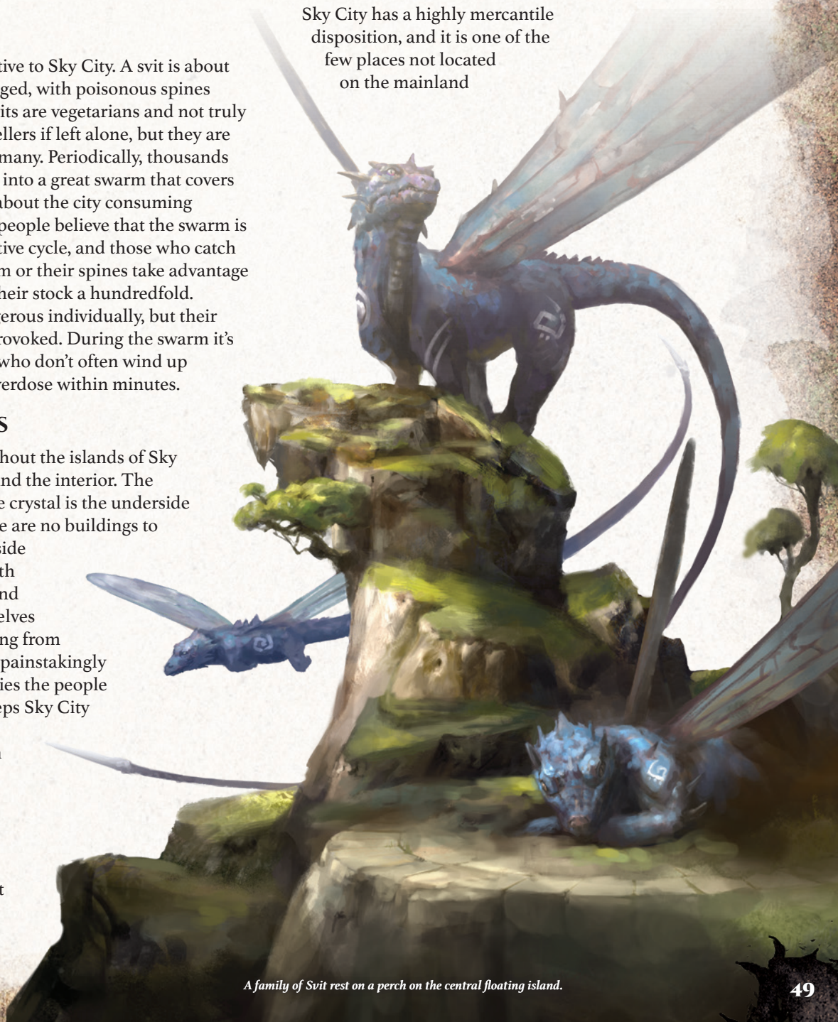
A family of Svits rest on a perch on the central floating island.

Sky City has a highly mercantile disposition, and it is one of the few places not located on the mainland