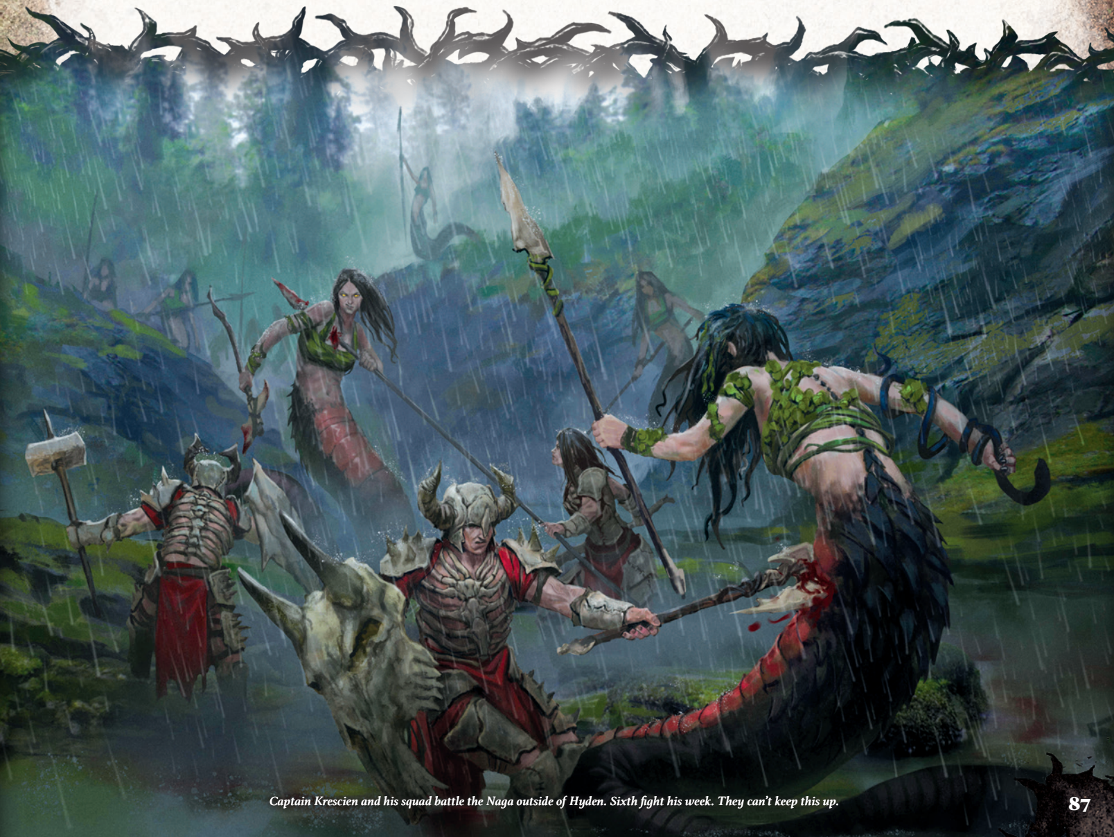
Captain Krescien and his squad battle the Naga outside of Hyden. Sixth fight his week. They can't keep this up.

Soon, word began to spread of the "Bone Army," an elite band of mercenaries who clothed themselves in bone and fought with bone weapons. Ever a pragmatist, General Khel insisted the Bone Army take a stance of absolute neutrality in all conflicts, except when being paid for their loyalty.