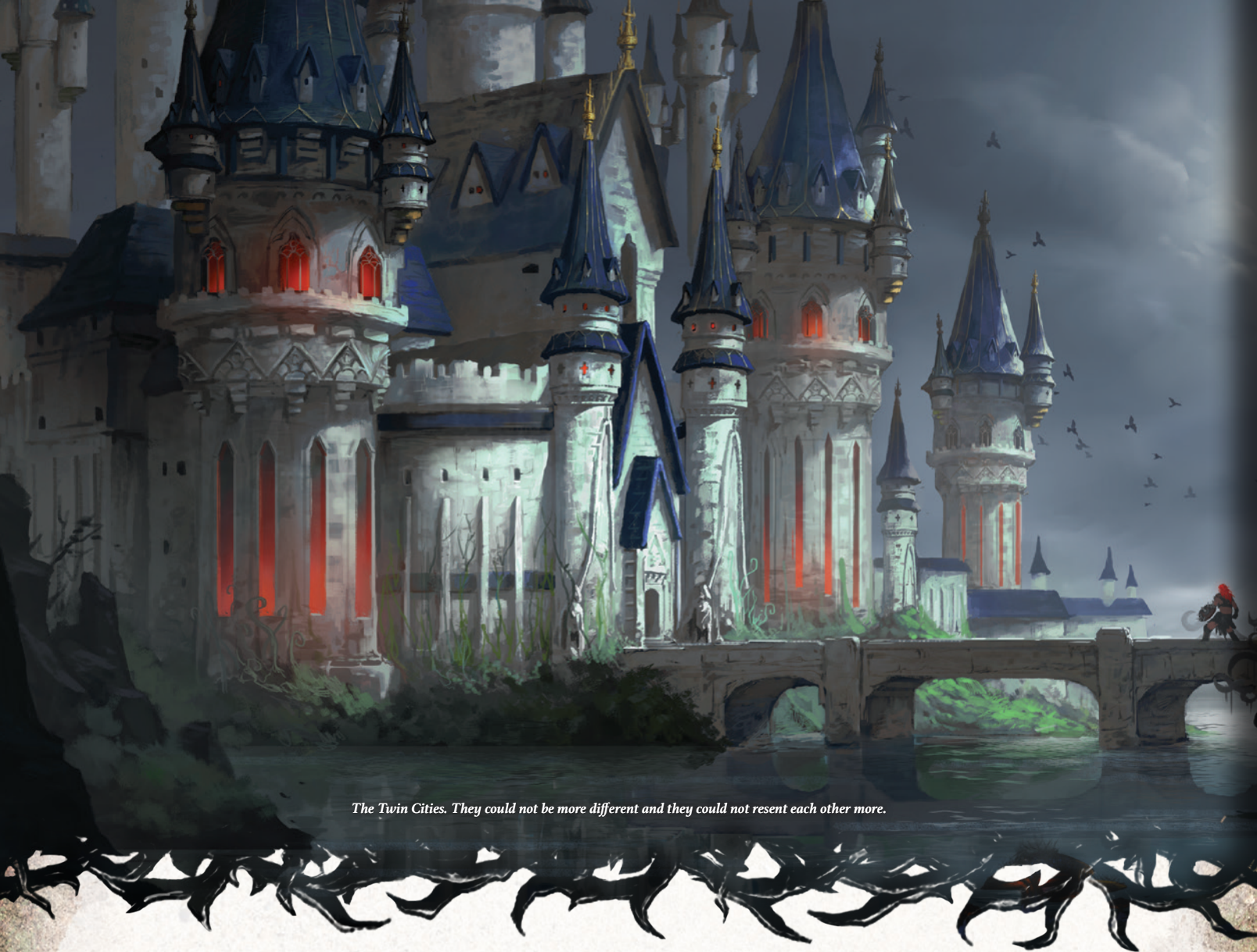
The Twin Cities. They could not be more different and they could not resent each other more.

and banking. A common saying in the Twins is “What the West Makes, the East Takes.” This is true to a point, but it’s not the whole story. East Twin does indeed take a considerable amount of the produce grown by West Twin, but most of that is sold to other city-states or traded for other goods, and that profit benefits West Twin as much as it does East Twin. There’s a fair amount of resentment and rivalry between the two Twins, and some people grumble that the two will split off from each other and become their own separate city-states. The truth, though, is that the Twins exist in symbiosis. East would die without West’s yield, and West would shrivel without East to sell their goods to the wider world.