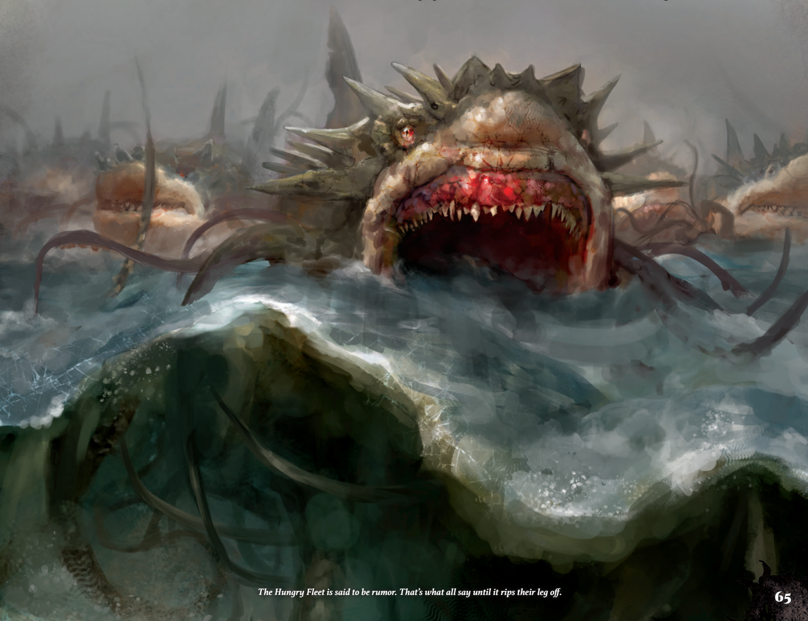
The Hungry Fleet is said to be rumor. That's what all say until it rips their leg off.

There's an archipelago—a continuous ring of tiny islands—that surrounds the entirety of the mainland. Though a great many of these islands are too tiny to support any kind of life or settlement, there are still quite a few that are big enough for settlements, and nearly all of them are inhabited at least part of the time. Known collectively as the Thousand Ports, some of these small islands have permanent settlements that act as places for Seafarers to stop and replenish supplies, while a great many more serve as temporary homes for the nomadic sea people. In both cases, permanent residence is rare. On the occasionally-inhabited islands, crews will make landfall, set up a temporary camp, blow off steam or take shelter during a storm, and move on, ensuring that the dock and any other structures on the island are well-maintained for the next crew. Even on the islands that have a constant population, the residents tend to come and go at a