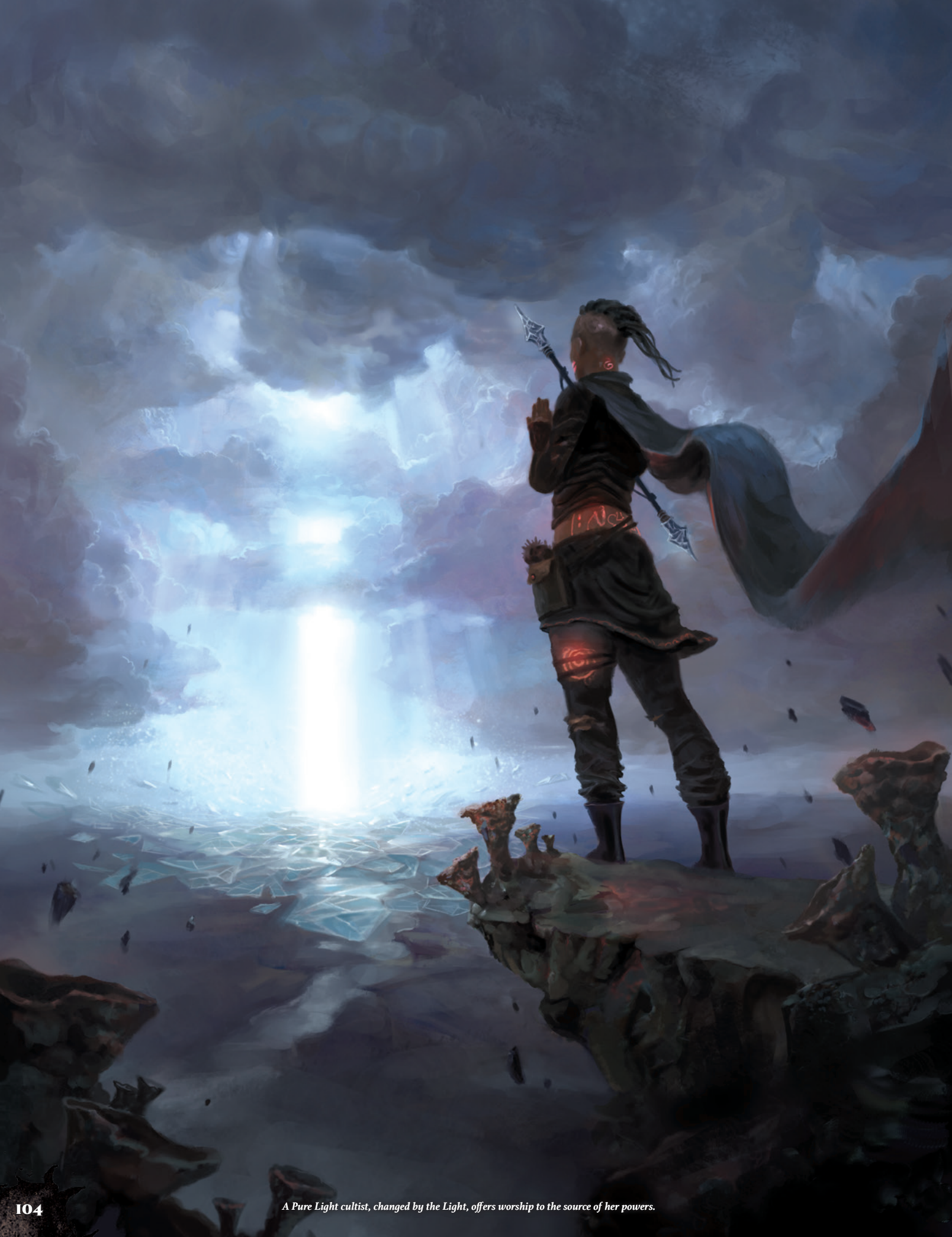
A Pure Light cultist, changed by the Light, offers worship to the source of her powers.