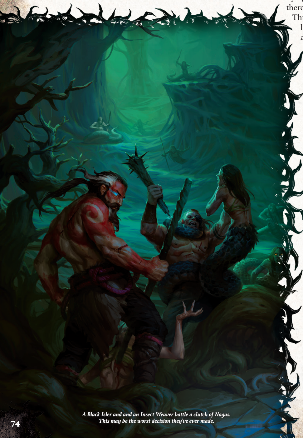
A Black Isler and an Insect Weaver battle a clutch of Nagas. This may be the worst decision they've ever made.

There is a swath of land beyond the Naga swamps that is virtually unreachable by land, and the oceans around it are so buffeted by violent storms and riddled with jutting rocks and coral that no one save the occasional Seafarer vessel dares to brave the seas to make landfall. Those who speak of this place believe that a god lives there, one that was cast down and never left with the others. They believe this god hides in his land, hoarding great treasures and protecting them jealously from those who would usurp them. Some have gone and come back, though, and tell stories of a great well of Chaos there that offers unlimited power to those strong enough or insane enough to take it.