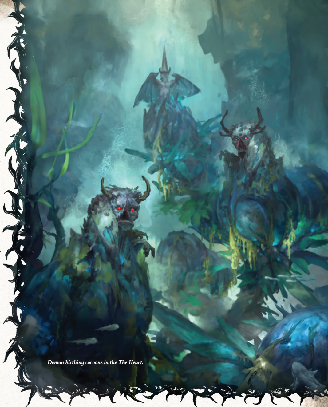
Demon birthing cocoons in the The Heart.

An exceptionally tall, wizened demon, Old Man Oak got his name from the Nanok tribe of Pacari; the Nanok elder thought the demon was a tree when she first saw