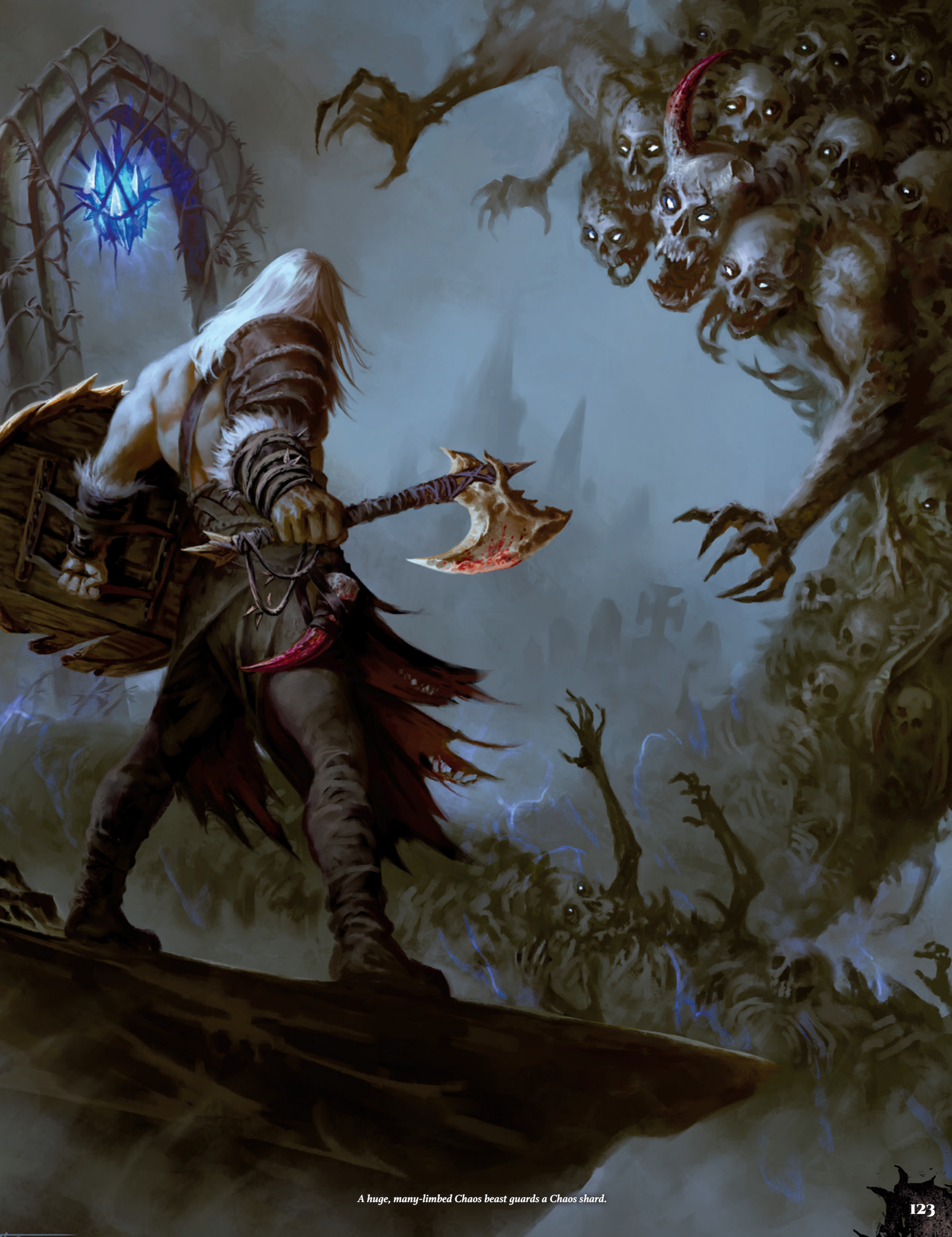
A huge, many-limbed Chaos beast guards a Chaos shard.