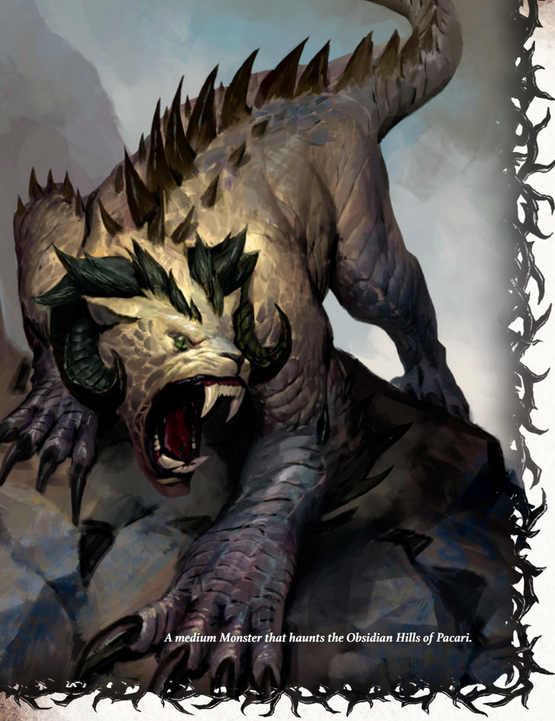
A medium Monster that haunts the Obsidian Hills of Pacari.