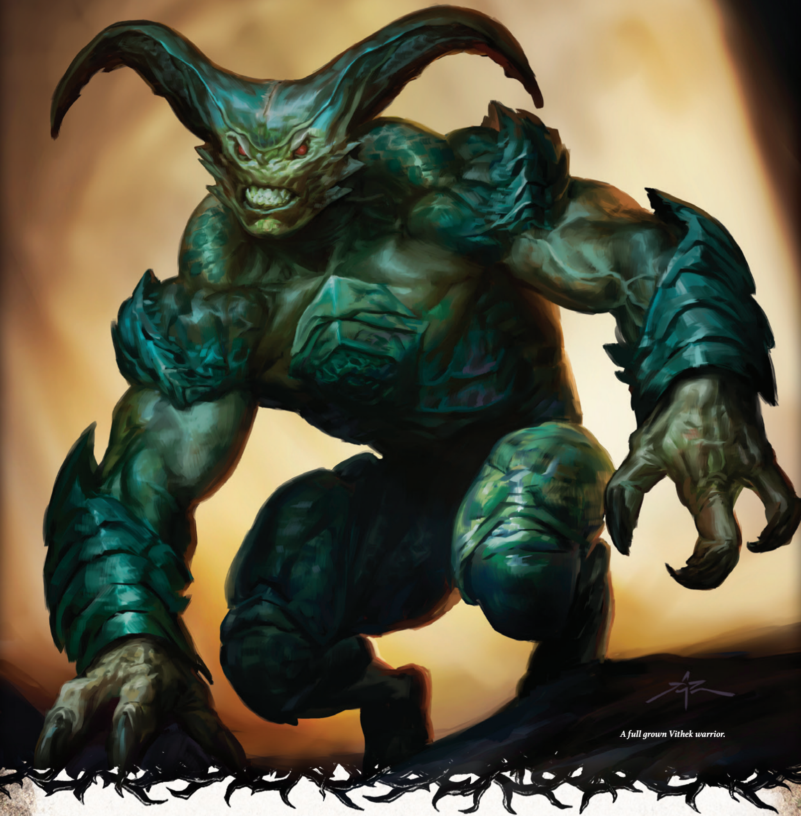
A full grown Vithek warrior.

whom they do not share a hive bond. This means that outsiders—even Vithek from other hives—are typically viewed with suspicion, and everyone in a hive knows who (and where) every outsider is as long as one member of the hive does. Vithek can sometimes come across as paranoid or xenophobic when they encounter non-Vithek. To some extent, they are. This behavior comes from the fact that being around someone with whom they cannot share thoughts is unsettling to Vithek; the