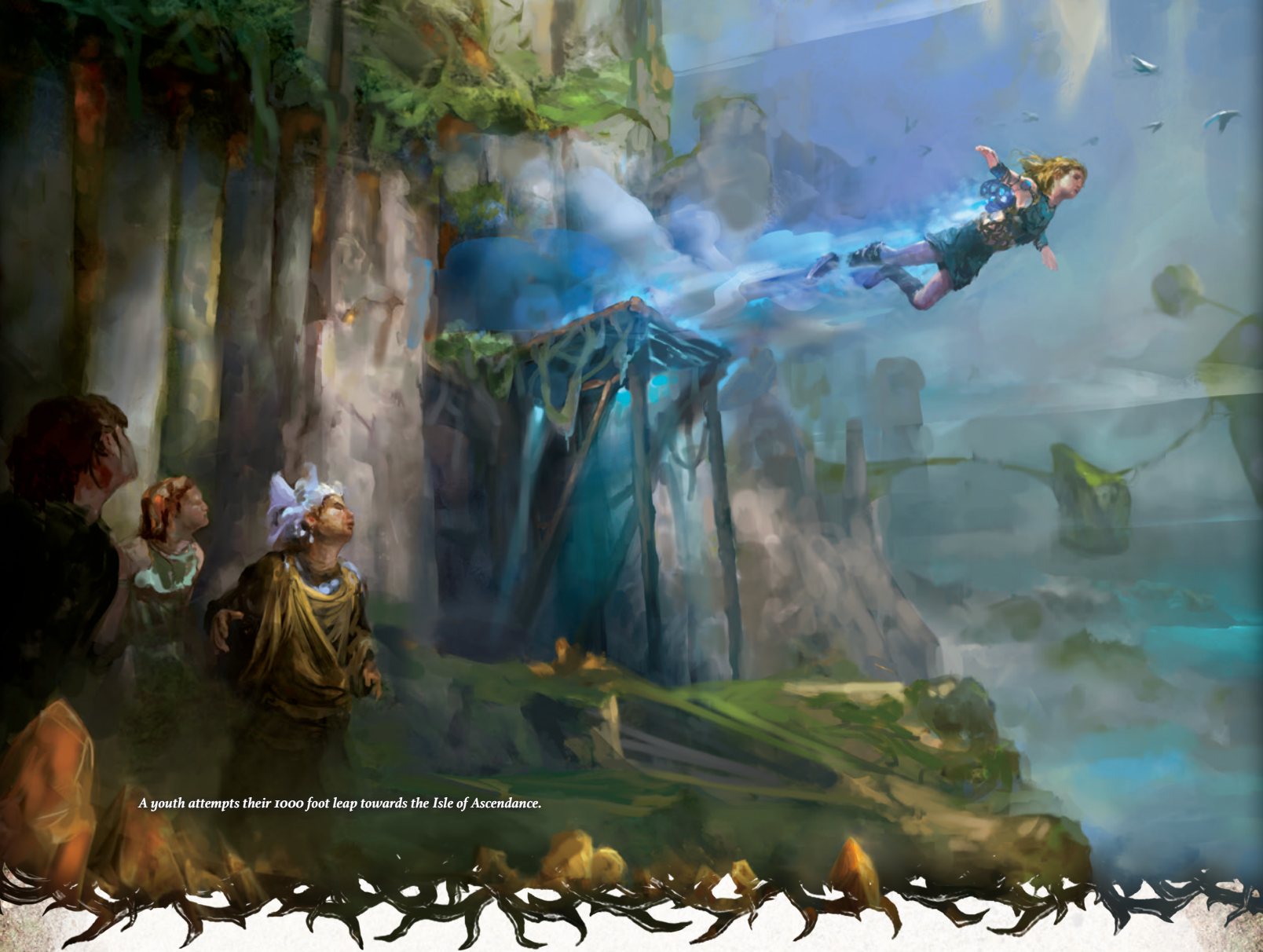
A youth attempts their 1000 foot leap towards the Isle of Ascendance.

selling them to less scrupulous members of the nobility. Though thievery is publicly frowned upon and punished severely, many of the noble houses employ thieves as pawns in their Great Game, a complex web of political maneuvering and illegal activity that happens in the shadows.