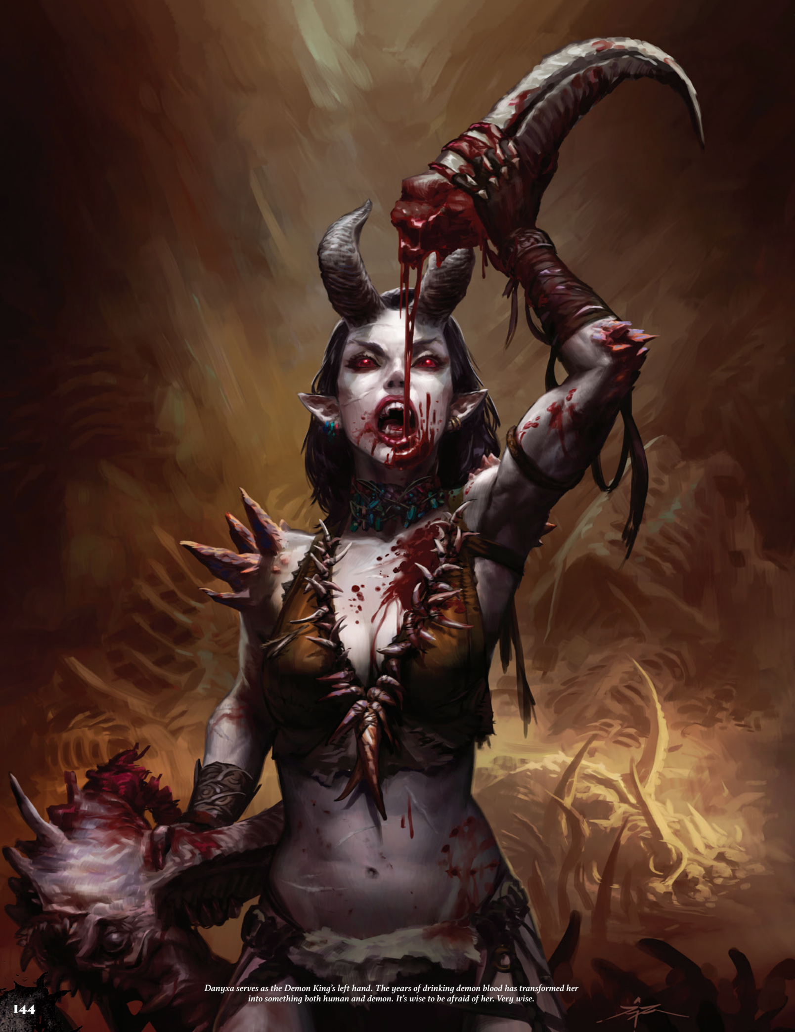
Danyxa serves as the Demon King's left hand. The years of drinking demon blood has transformed her into something both human and demon. It's wise to be afraid of her. Very wise.