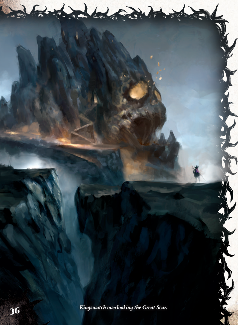
Kingswatch overlooking the Great Scar.

Just beyond Coward's Point, jutting out from the sea, is a chunk of black rock that has formed into the visage of a grinning skull. The Black Islers say that nobody carved this skull and that it was there even before humans walked the world. Its mouth, slightly open, is large enough for a human to crawl into, and legends say that there are great treasures and knowledge waiting for those who can brave the perils inside. Black Islers aren't specific about what