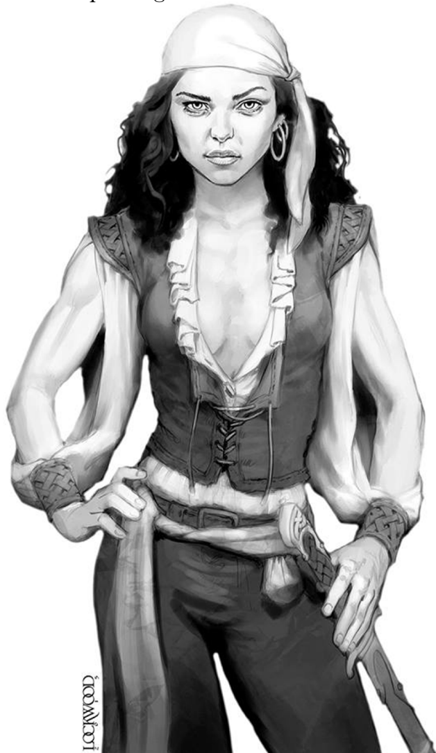
‘Torrent, a Corsair, was never far from trouble in mighty Taux’.

To create something unique, I decided to bind each primary race in the Nameless Realms fiction to a certain element. Some had strong ties, some not so much, but nonetheless each was polarized to either Fire, Air, Water, or Earth. Although there are twelve ‘prime’ races bound to these elements, there can really be a plethora of ‘sub’ races that bend the rules a bit, such as Humans that instead of being of low elemental fire affinity (which is the norm), might have an earth affinity because of something that has happened to a certain tribe of them over the course of passing millennia.