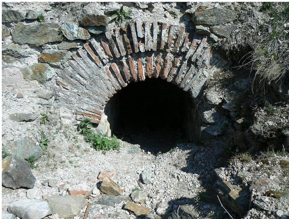
The entrance to the dungeon above and the stairwell below