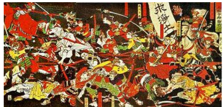
An Ukiyo-e print depicting the Battle of Azukizaka. On his early days as daimyo of Mikawa Ieyasu had difficult relations with the Jodo temples which scaled in 1563-64.

For the next few years Motonobu set to reform the Matsudaira clan and pacifying Mikawa. He also strengthened his key vassals by awarding them land and castles in Mikawa. They were: Honda Tadakatsu, Ishikawa Kazumasa, Koriki Kiyonaga, Hattori Hanzō, Sakai Tadatsugu, and Sakakibara Yasumasa.