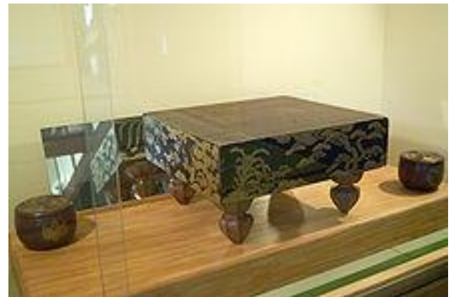
Hideyoshi and Ieyasu played Go on this board.

In 1584, Ieyasu decided to support Oda Nobukatsu, the eldest son and heir of Oda Nobunaga, against Hideyoshi. This was a dangerous act and could have resulted in the annihilation of the Tokugawa.