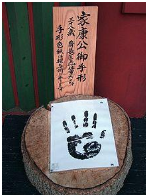
Handprint of Ieyasu at Kunozan Toshogu

Games Workshop, the Games Workshop logo, Warhammer, Warhammer Historical Wargames and the Warhammer Historical Wargames logo are trademarks of Games Workshop, Ltd