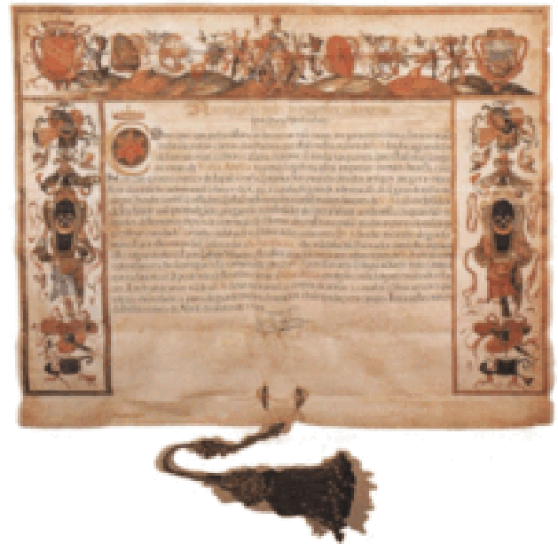
Letter from Duarte de Meneses, viceroy of Portuguese India, to Hideyoshi dated April 1588, concerning the suppression of Christians, a National Treasure of Japan

The stability of the Toyotomi dynasty after Hideyoshi's death was put in doubt with the death of his only son Tsurumatsu in September 1591. The three-year-old was his only child. When his half-brother Hidenaga died shortly after his son, Hideyoshi named his nephew Hidetsugu his heir, adopting him in January 1592. Hideyoshi resigned as kampaku to take the title of taikō (retired regent). Hidetsugu succeeded him as kampaku .