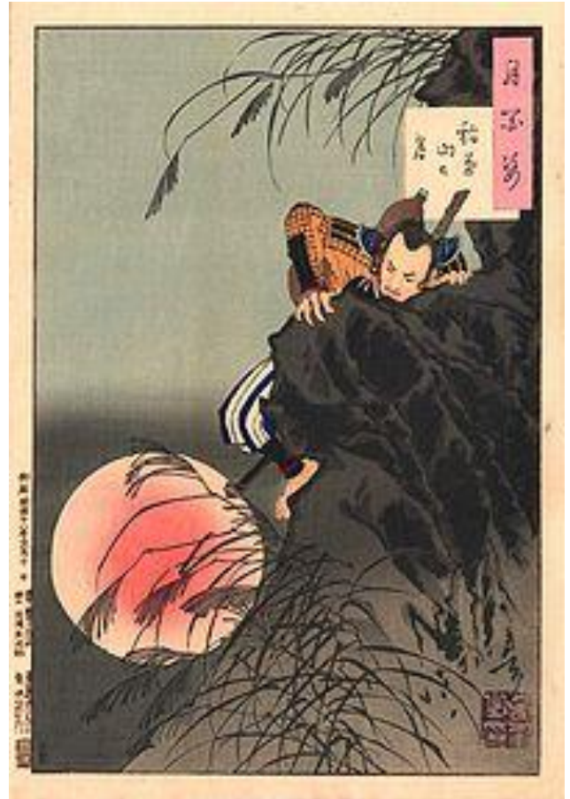
100 Aspects of the Moon #7, by Tsukioka Yoshitoshi: "Mount Inaba Moon."

took control of the nearby Kunitomo firearms factory that had been established some years previously by the Azai and Asakura. Under Hideyoshi's administration the factory's output of firearms increased dramatically.