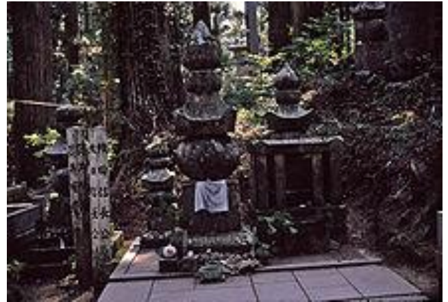
Grave of Oda Nobunaga at Mount Kōya, Wakayama Prefecture

In any case, Nobunaga ordered Niwa Nagahide to prepare for an invasion of Shikoku, and Akechi Mitsuhide to assist Hideyoshi. En route to Chūgoku region, Nobunaga stayed at Honnō-ji, a temple in Kyoto. Since Nobunaga would not expect an attack in the middle of his firmly-controlled territories, he was guarded by only a few dozen personal servants and bodyguards.