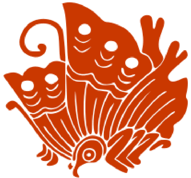
The butterfly mon of the Taira is called Ageha-cho (揚羽蝶) in Japanese.

"Life is like unto a long journey with a heavy burden. Let thy step be slow and steady, that thou stumble not. Persuade thyself that imperfection and inconvenience are the lot of natural mortals, and there will be no room for discontent, neither for despair. When ambitious desires arise in thy heart, recall the days of extremity thou have passed through. Forbearance is the root of all quietness and assurance forever. Look upon the wrath of thy enemy. If thou only knows what it is to conquer, and knowest not what it is to be defeated; woe unto thee, it will fare ill with thee. Find fault with thyself rather than with others."