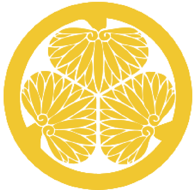
The Tokugawa clan crest

Following a well established Japanese pattern, Ieyasu abdicated his official position as shogun in 1605. His successor was his son and heir, Tokugawa Hidetada. This may have been done, in part to avoid being tied up in ceremonial duties, and in part to make it harder for his enemies to attack the real power center, and in part to secure a smoother succession of his son. 10 The abdication of Ieyasu had no effect on the practical extent of his powers or his rule; but Hidetada nevertheless assumed a role as formal head of the bakufu bureaucracy.