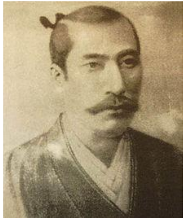
Portrait of Oda Nobunaga, by Jesuit painter Giovanni Niccolo, 1583-1590.

In 1551, Oda Nobuhide died unexpectedly and, during his funeral, Nobunaga was said to have acted outrageously, throwing the ceremonial incense at the altar. 3 This act alienated many Oda retainers, convincing them of Nobunaga's mediocrity and lack of discipline and they began to side with his more soft-spoken and well-mannered brother, Nobuyuki. Hirate Masahide, who was a