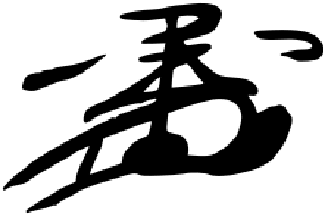
Kaō of Hideyoshi

Like Nobunaga before him, Hideyoshi never achieved the title of shogun. Instead, he arranged to have himself adopted into the Fujiwara Regents House, and secured a succession of high imperial court titles including, in 1585 the prestigious position of regent ( kampaku ). 12 In 1586, Hideyoshi was formally given the name Toyotomi by the imperial court. 5 He built a lavish palace, the Jurakudai, in 1587 and entertained the reigning Emperor Go-Yōzei the following year.