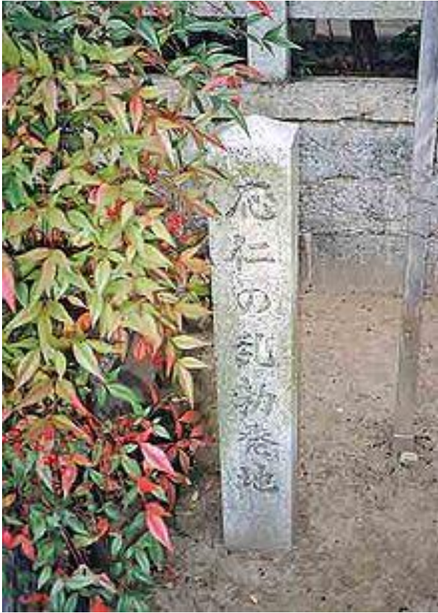
Marker at location of outbreak of the Ōnin War

The Ōnin War (応仁の乱 Ōnin no Ran 2 ) was a civil war that lasted 10 years (1467–1477) during the Muromachi period in Japan. 1 A dispute between Hosokawa Katsumoto and Yamana Sōzen escalated into a nationwide war involving the Ashikaga shogunate and a number of daimyo in many regions of Japan.