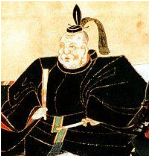
Tokugawa Ieyasu as shogun.

On March 24, 1603, Tokugawa Ieyasu received the title of shogun from Emperor Go-Yōzei. 9 Ieyasu was 60 years old. He had outlasted all the other great men of his times: Nobunaga, Hideyoshi, Shingen, Kenshin. He was the