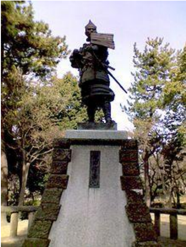
Statue of Oda Nobunaga at Kiyosu Castle

Mount Qi (岐山 Qi in Standard Chinese) in China, on which the Zhou dynasty started, Nobunaga revealed his ambition to conquer the whole of Japan. He also started using a new personal seal that read Tenka Fubu (天下布武), 7 which means "Spread the militarism over the whole land", or literally "... under the sky" (see all under heaven ). In 1564, Nobunaga had his sister, Oichi, marry Azai Nagamasa, a daimyo in northern Ōmi Province. This would later help pave the way to Kyoto.