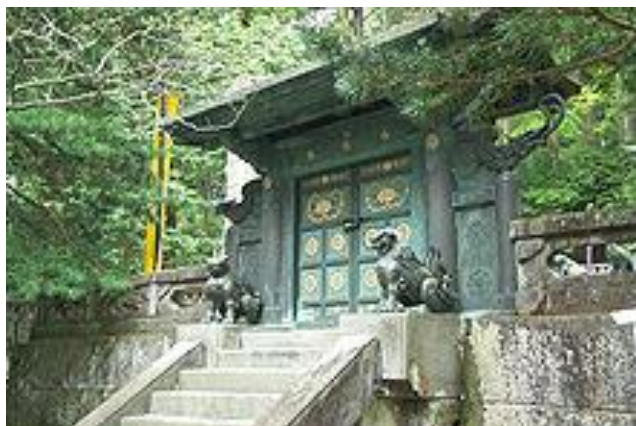
Grave of Ieyasu in Tōshō-gū

The climax of Ieyasu's life was the siege of Osaka Castle (1614–1615). The last remaining threat to Ieyasu's rule was Hideyori, the son and rightful heir to Hideyoshi. He was now a young daimyo living in Osaka Castle. Many samurai who opposed Ieyasu rallied around Hideyori, claiming that he was the rightful ruler of Japan. Ieyasu found fault with the opening ceremony of a temple built by Hideyori—it was as if Hideyori prayed for Ieyasu's death and the ruin of Tokugawa clan. Ieyasu ordered Toyotomi to leave Osaka Castle, but those in the castle refused and started to gather samurai into the castle. Then the Tokugawa, with a huge army led by Ogosho Ieyasu and Shogun Hidetada, laid siege to Osaka castle in what is now known as "the Winter Siege of Osaka." Eventually, Tokugawa made a deal threatening Hideyori's mother, Yodogimi, firing cannons towards the castle to stop the fighting. However, as soon as the treaty was agreed upon, Tokugawa filled Osaka Castle's moats with sand so his