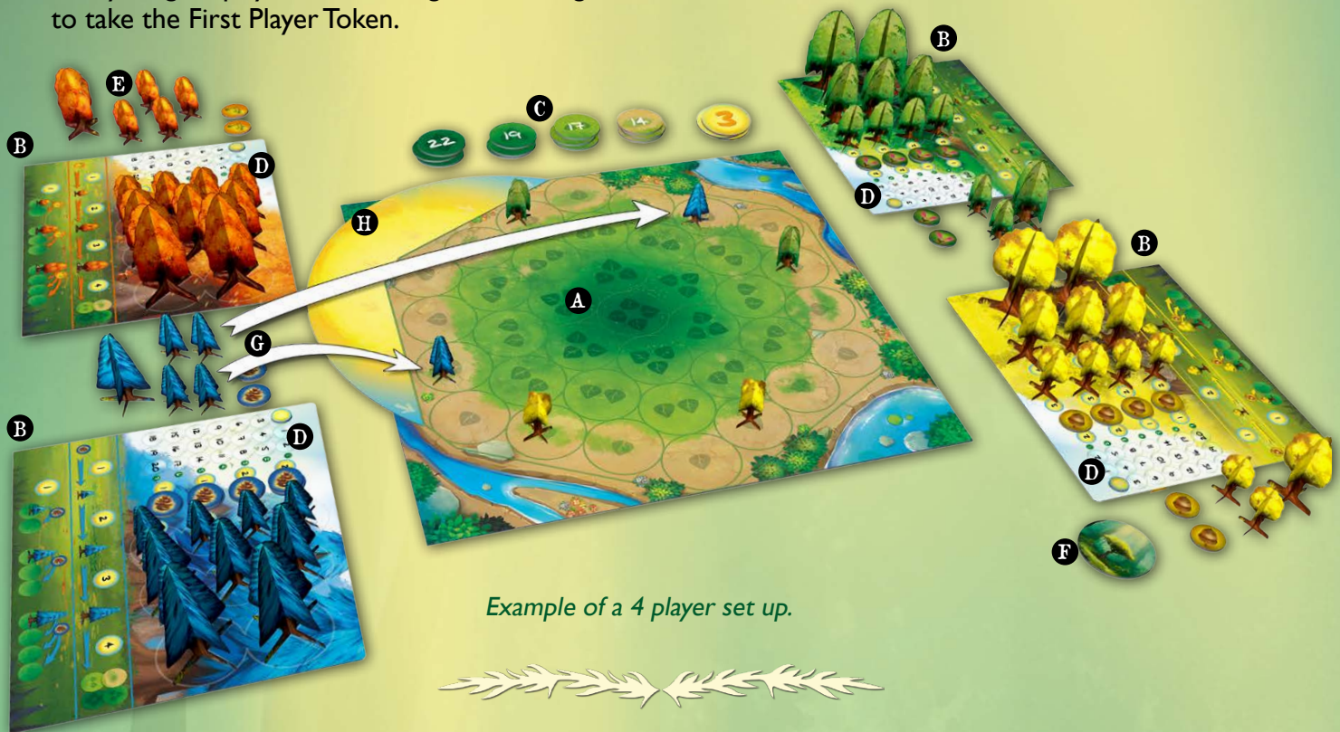
Example of a 4 player set up.

2 player game: Leave the 3 darkest green Scoring Tokens that have 4 leaves printed on them in the box, they will not be used. When players collect Scoring Tokens from the middle 4 leaf space, they instead take the tokens from the 3 leaf stack.