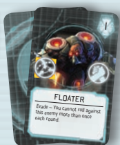
63 ENEMY CARDS