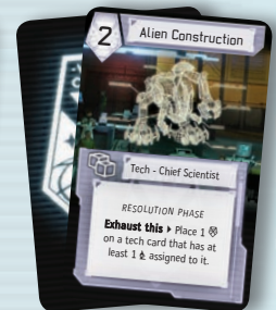
28 TECH CARDS