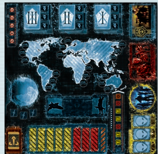
1 GAME BOARD