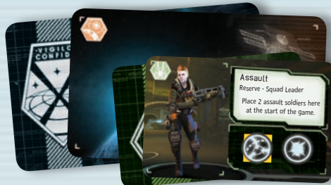
7 RESERVE CARDS (2 SIZES)