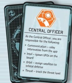
4 ROLE REFERENCE CARDS