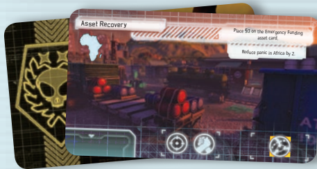
12 MISSION CARDS