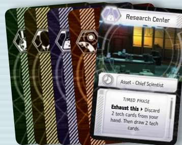
15 ASSET CARDS