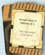
32 CRISIS CARDS