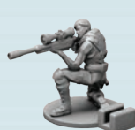
3 SNIPER SOLDIERS