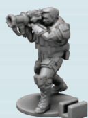
3 HEAVY SOLDIERS