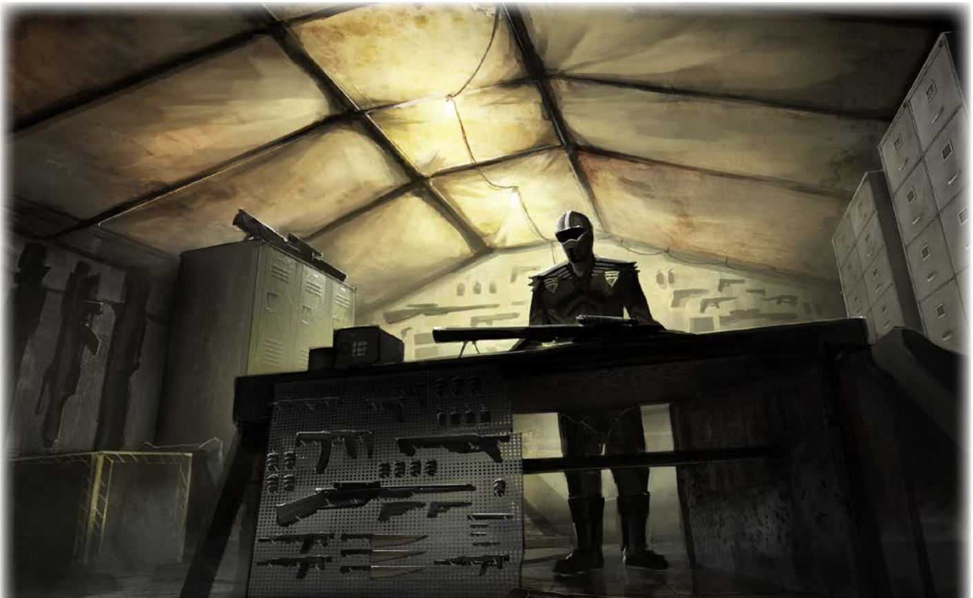
The Sandbox , ©2015, Sine Nomine Publishing