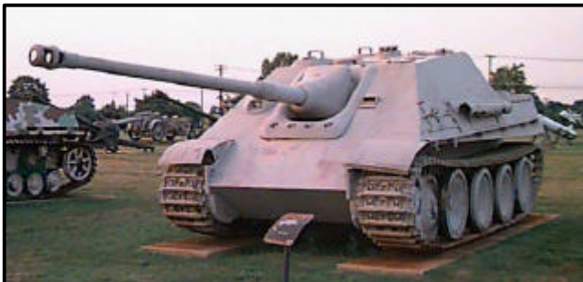
Jagdpanther on display at Aberdeen Proving Grounds.