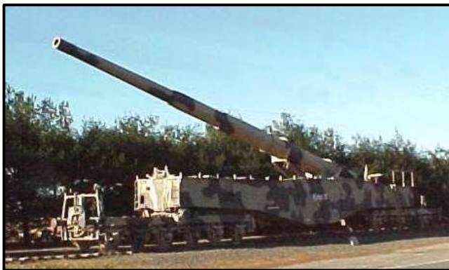
K-5 "LEOPOLD" 280 mm or 11 inch railroad gun