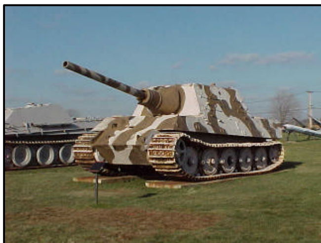
German Tank Destroyer "JADGTIGER"